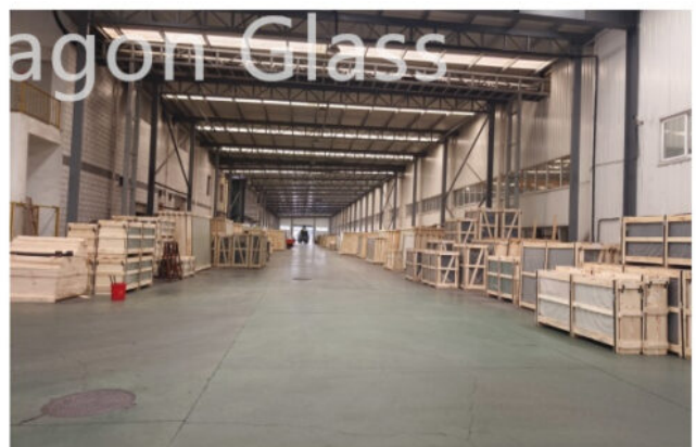
1/8 float glass supplier warehouse