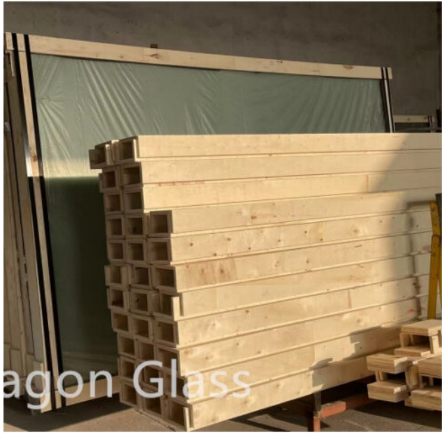
Excellent packages photos share here, we can load 30 containers per day for meeting your delivery time