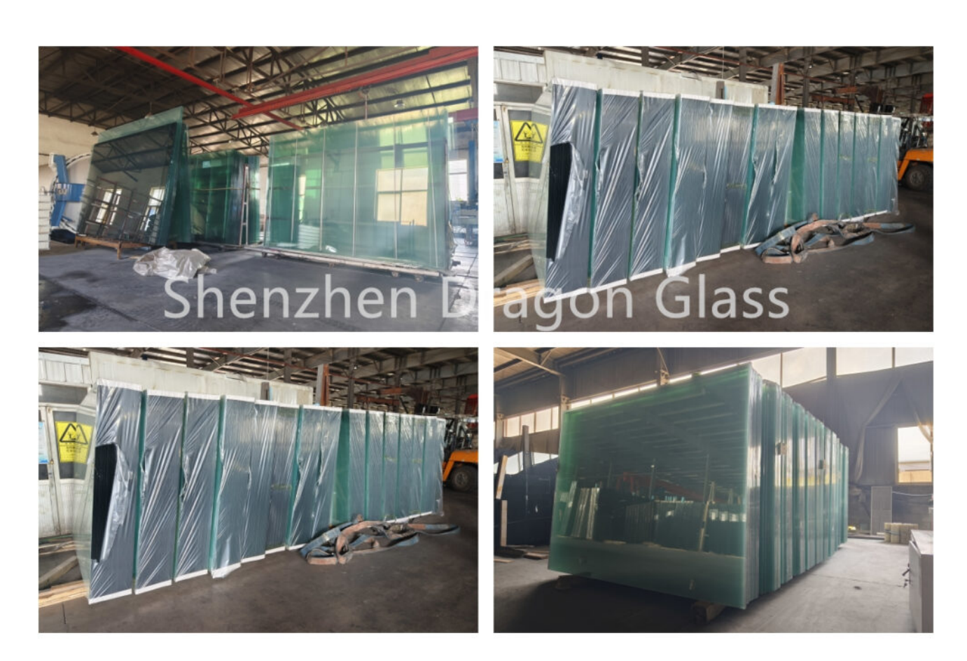
4mm glass sheet for sale