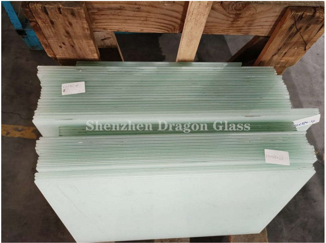
6.38 white annealed laminated glass