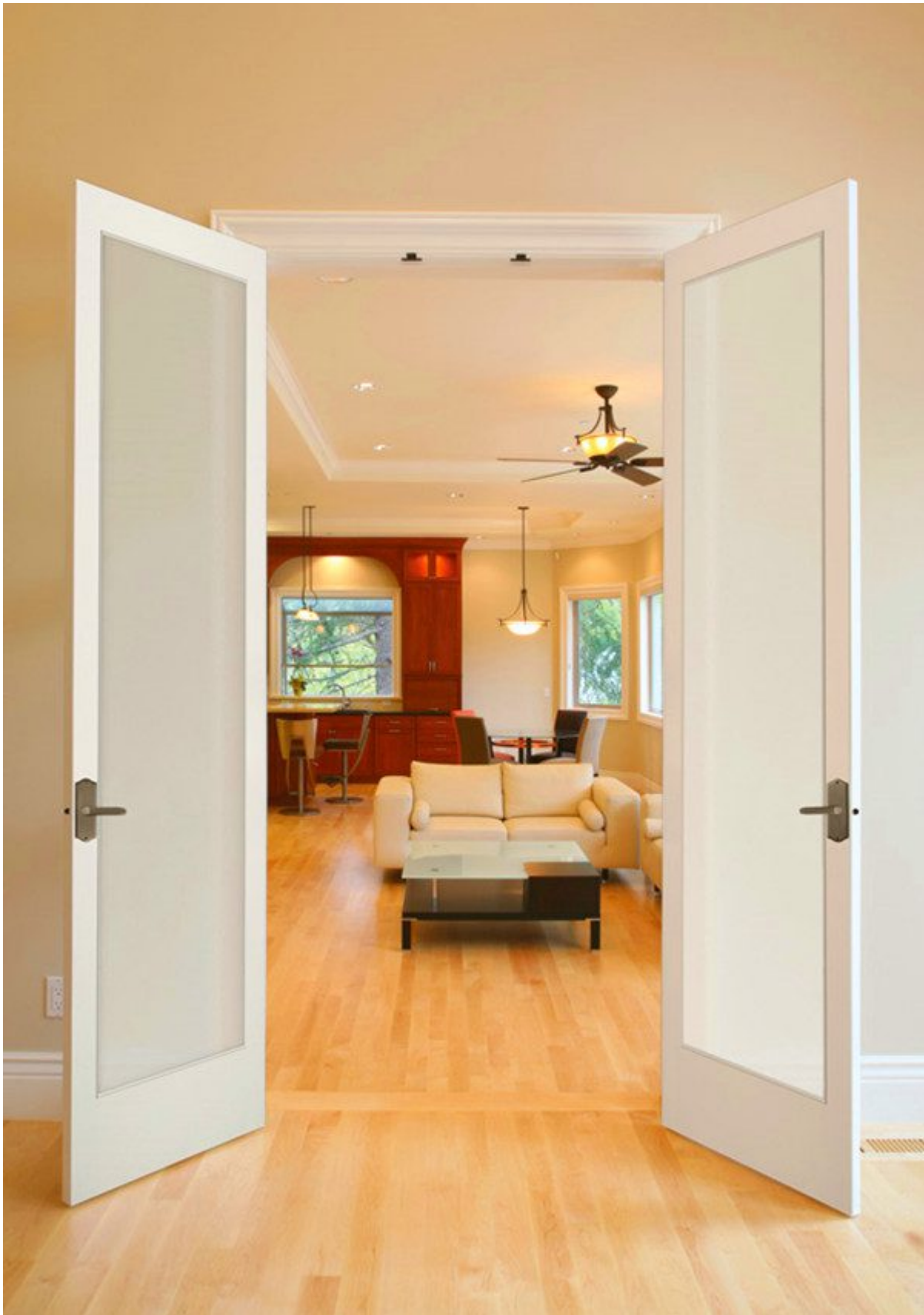
6.38mm laminated glass for French doors