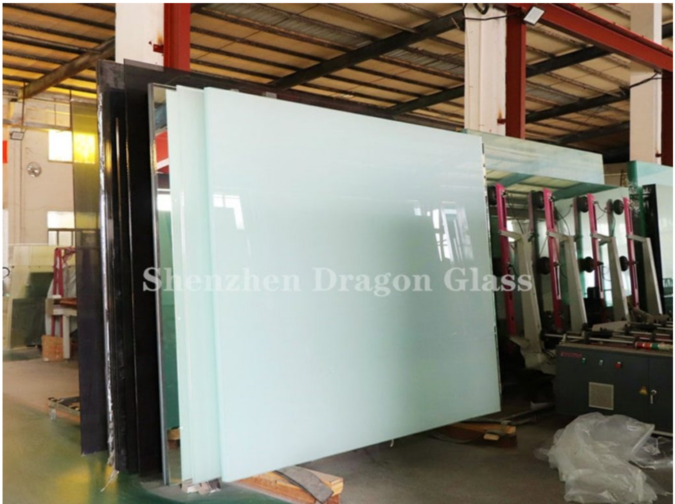
6.38 white annealed laminated glass