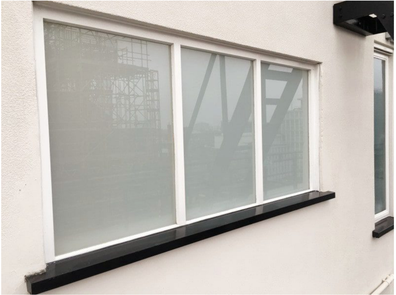
white laminated glass windows