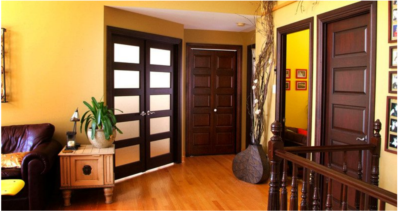
6.38mm laminated glass for French doors