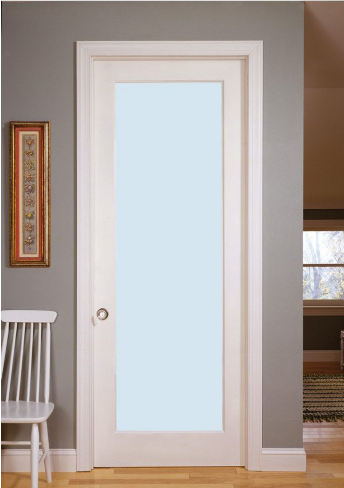
6.38mm laminated glass for French doors

In addition to the white lami door, it is also popular in the following places: