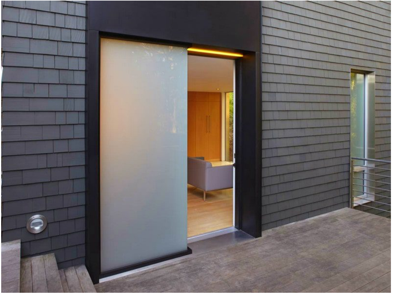
interior doors with white laminated glass