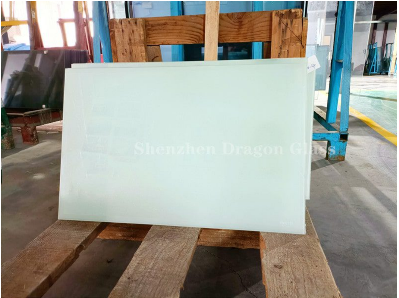
6.38 white annealed laminated glass