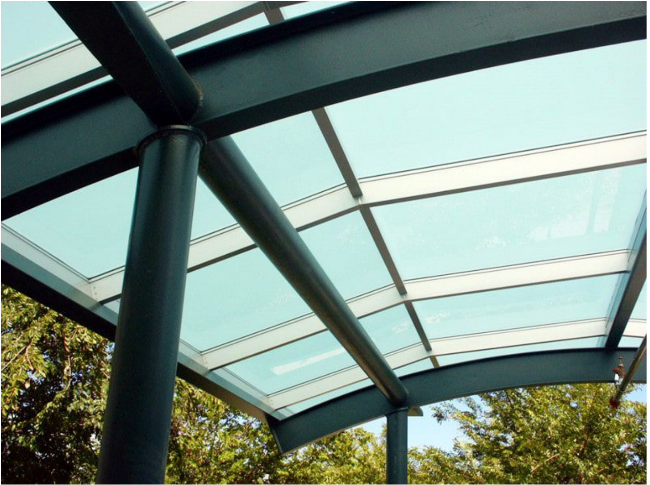
white laminate glass skylight