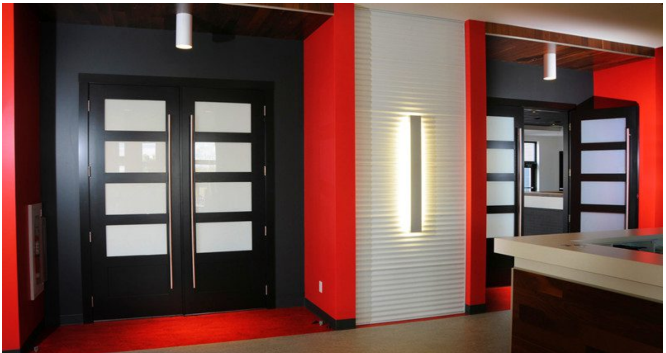
6.38mm laminated glass for French doors