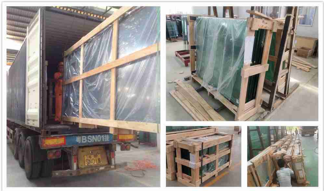
Packing and delivery details