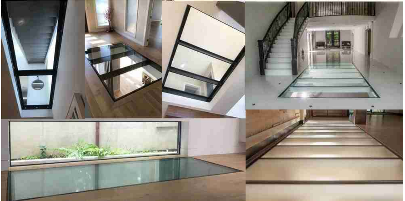
Structural glass floor system