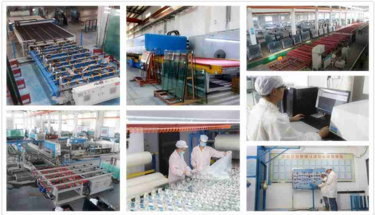
Shenzhen Dragon Glass production machines and testing, etc.