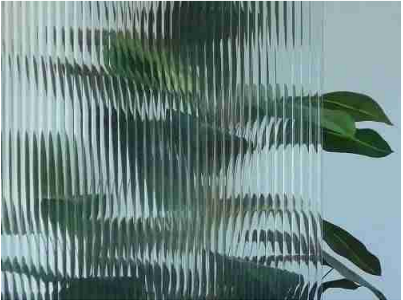
ribbed glass effect