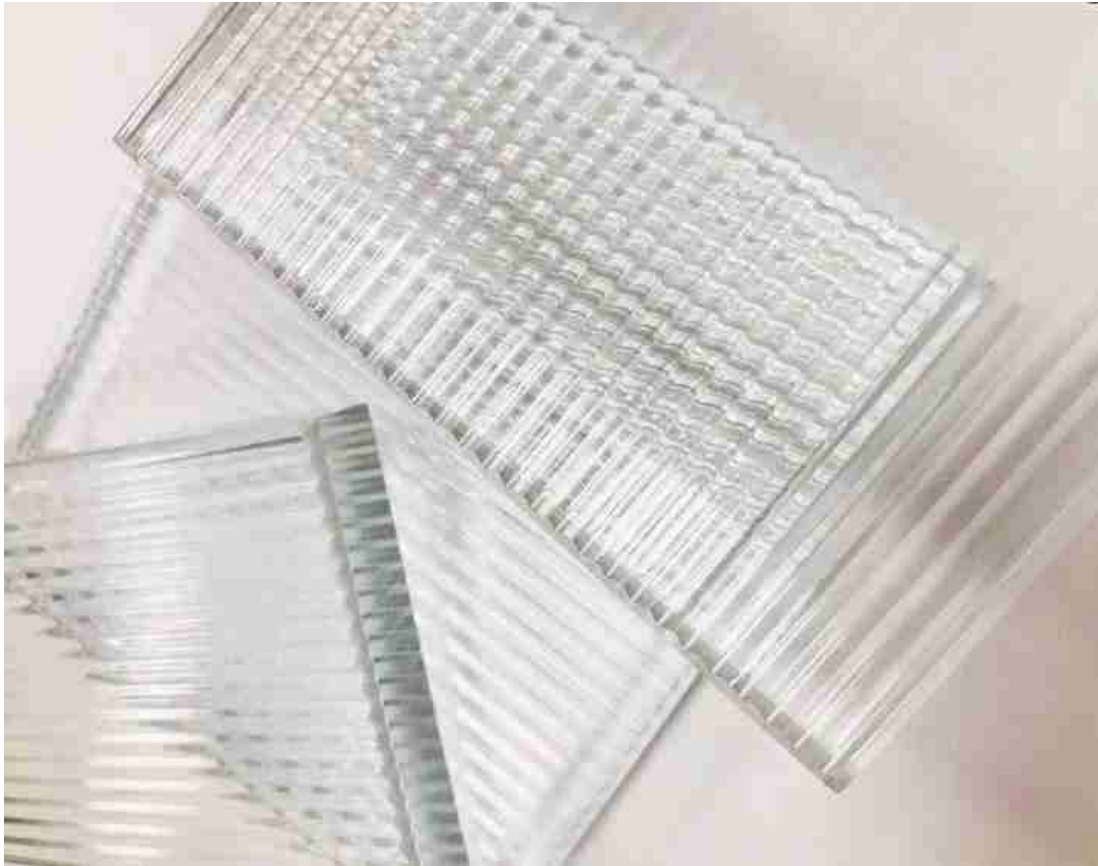
8mm ribbed glass