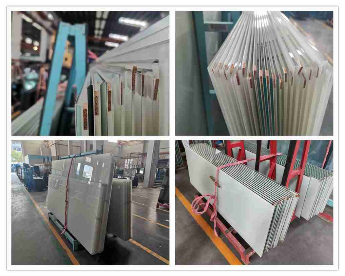
print a milky white screen on the glass to make the white laminated glass door