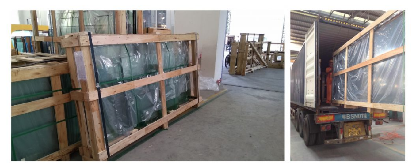
strong plywood crates to ensure safety during long-distance transportation