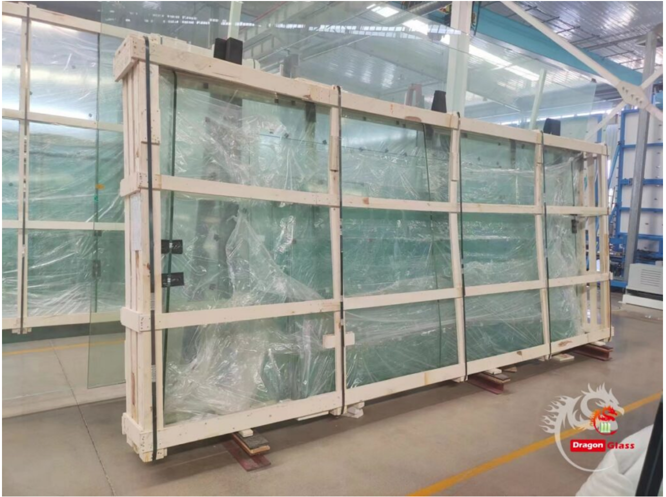
31.52mm thk SGP laminated for car showroom