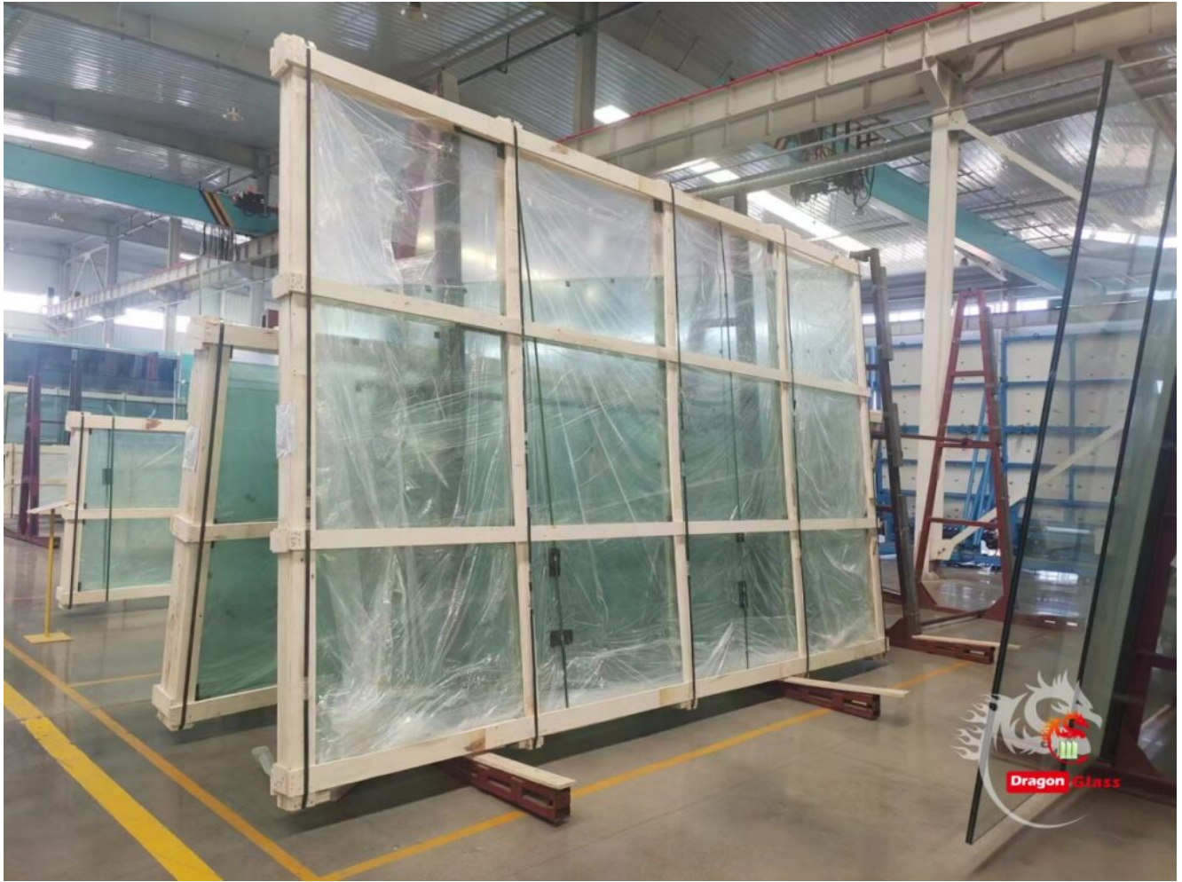
31.52mm thk SGP laminated for car showroom