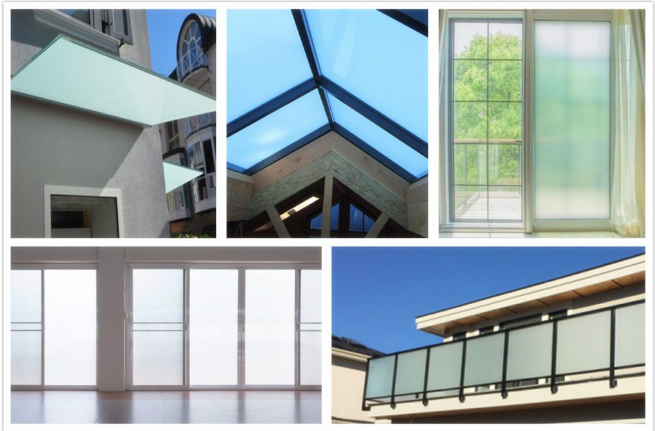
Frosted laminated glass applications