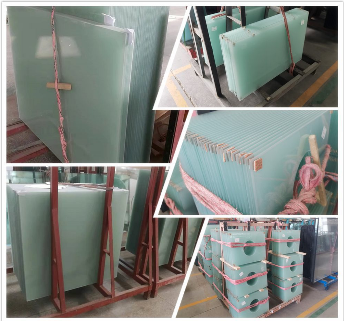
Frosted glass production details.