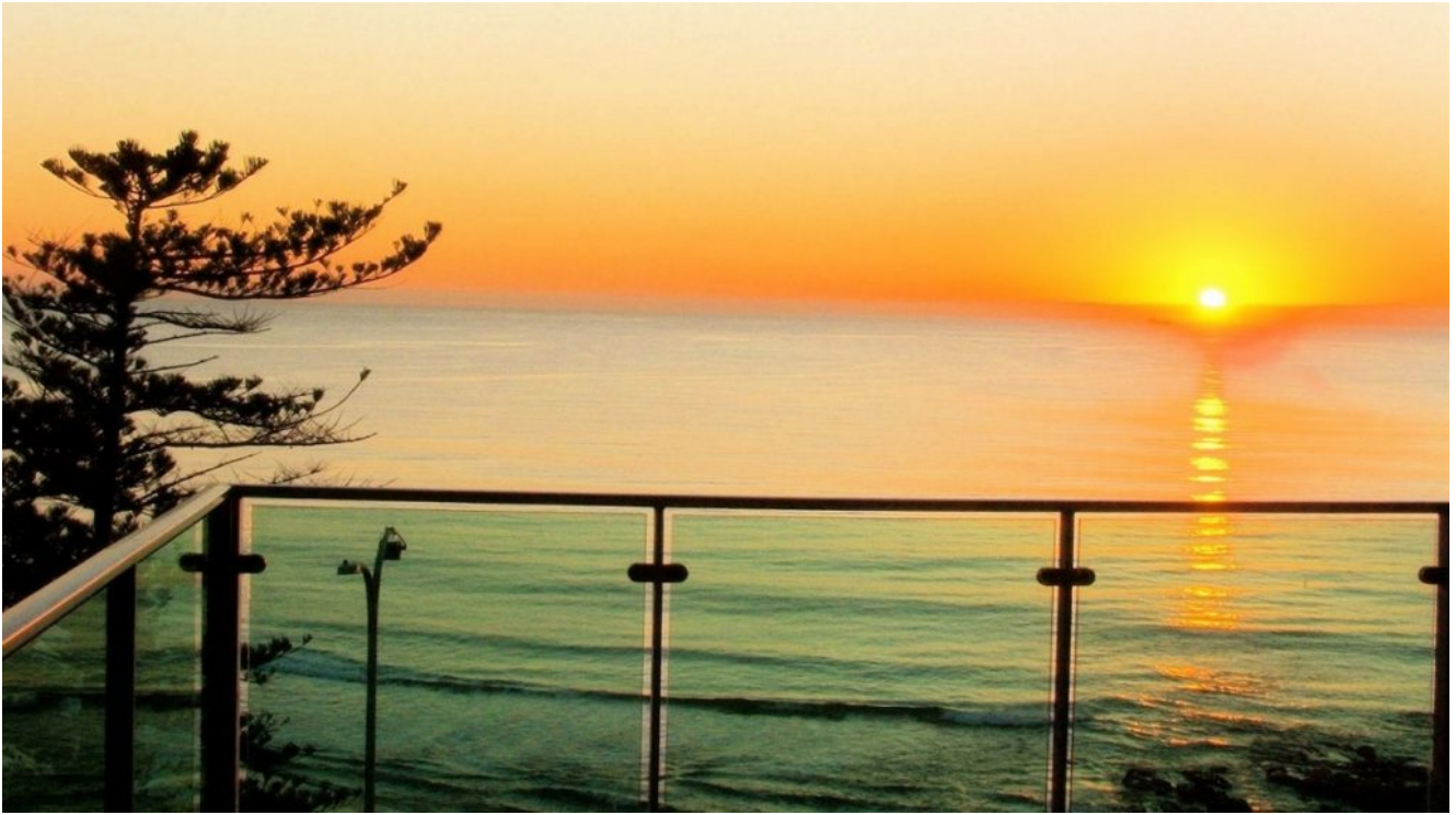
exterior glass railing