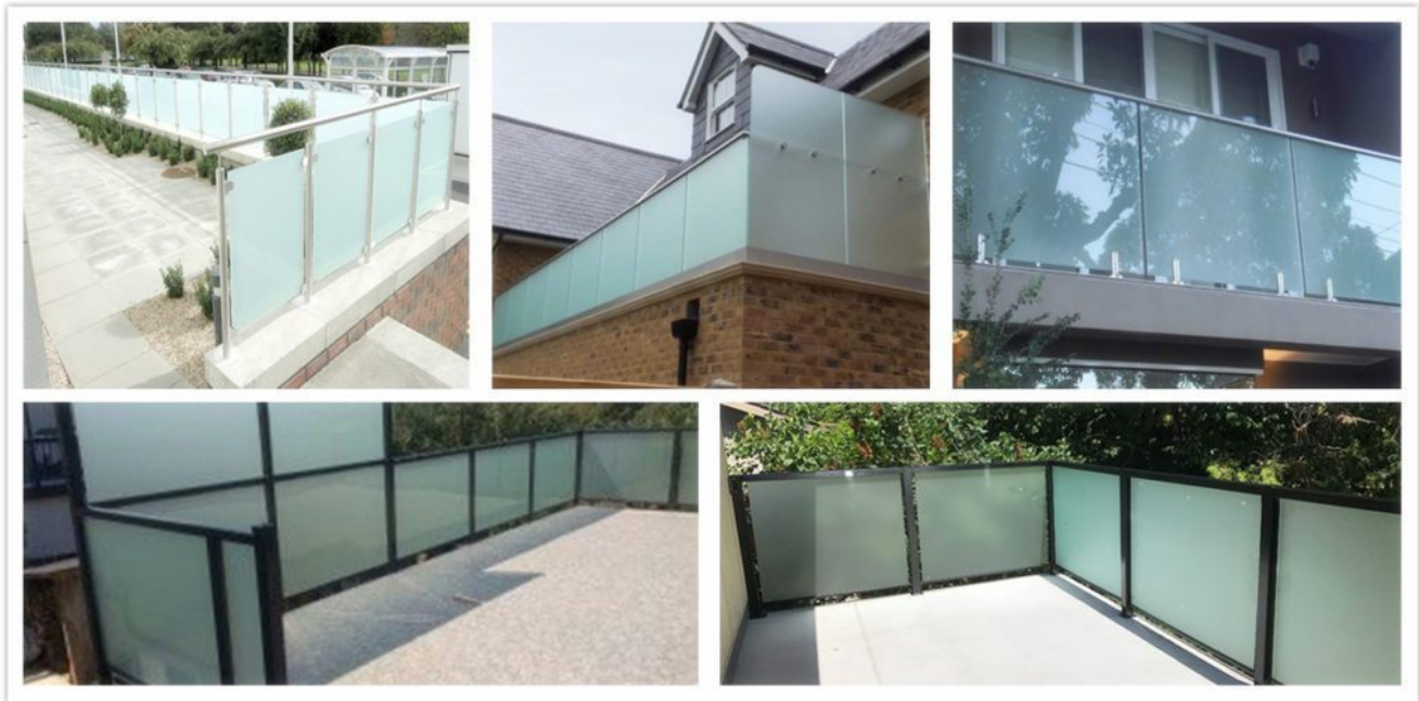
Frosted laminated glass for railing.

Where else can 17.52SGP clear frosted laminated glass panels be used for?