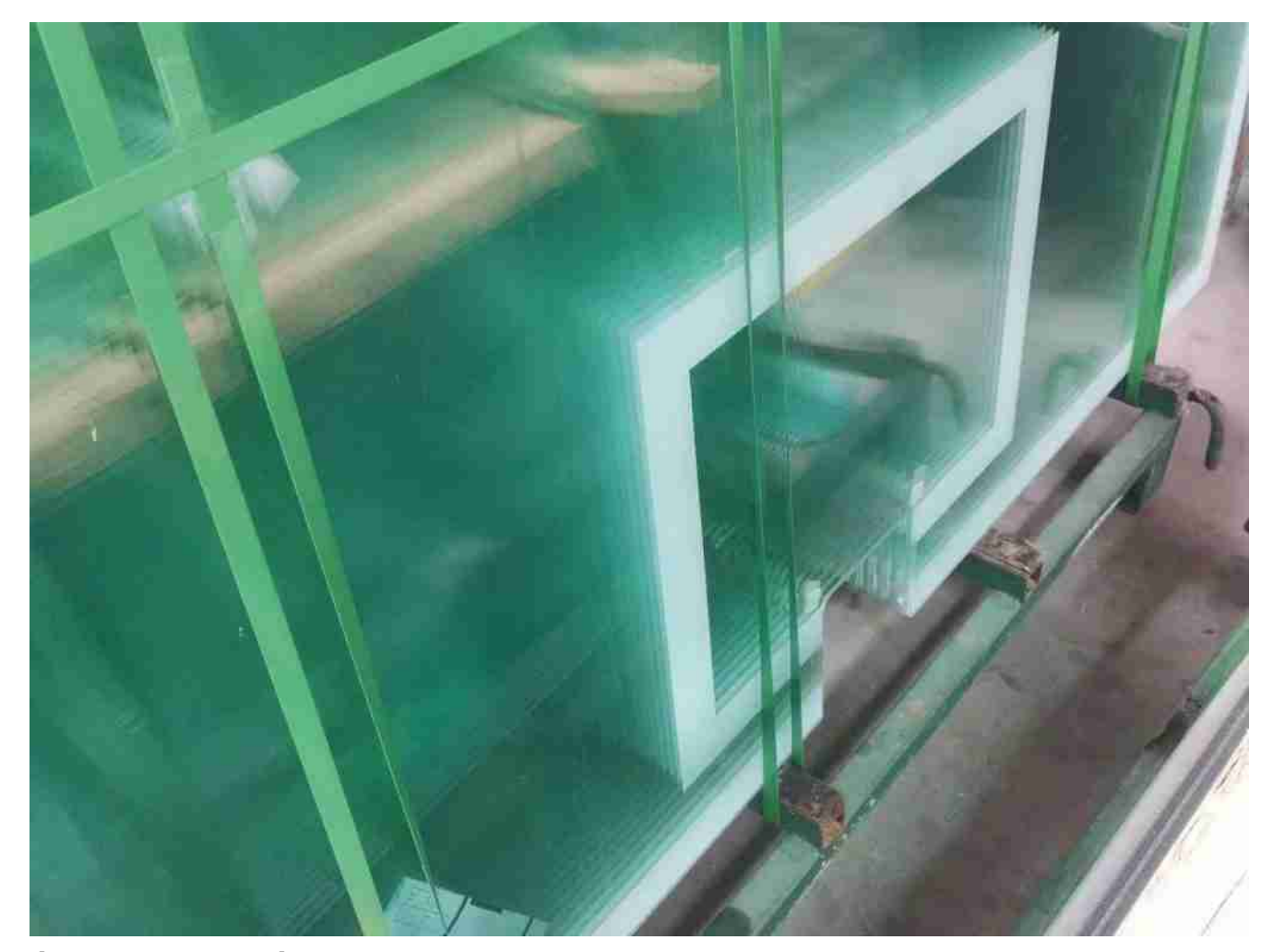
Silkscreen printed process