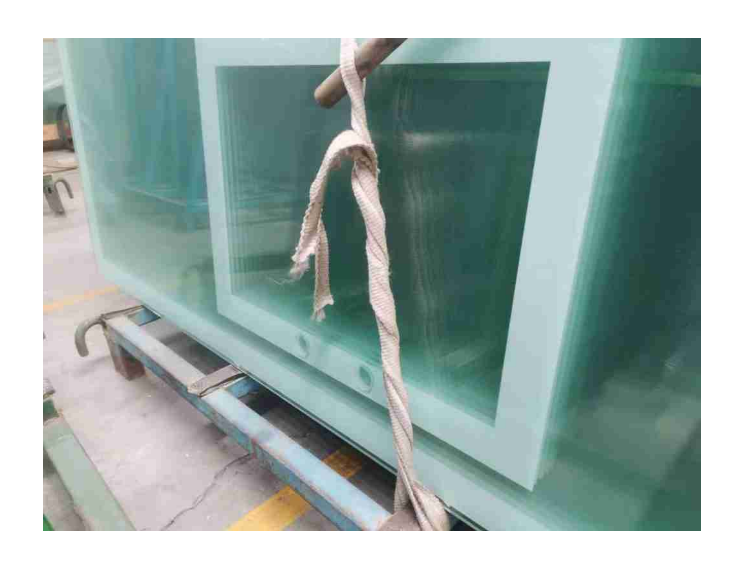
Packing and delivery