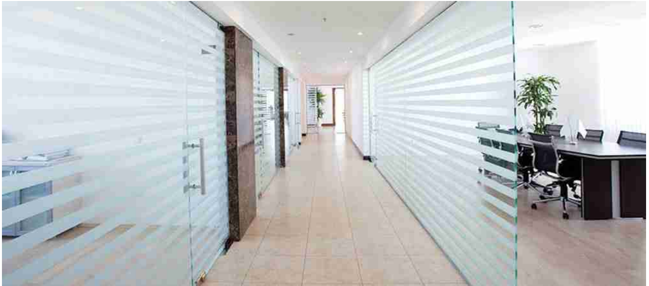
Sandblasting glass for partition wall decoration