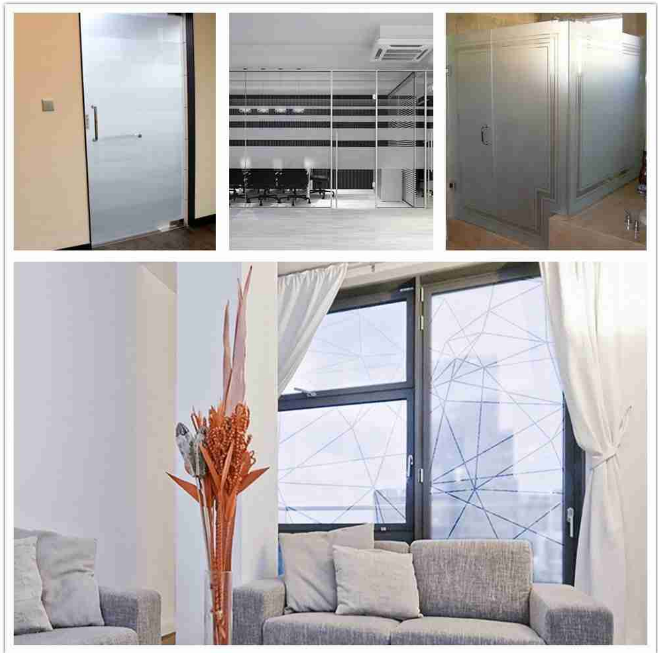
Sandblasted glass door