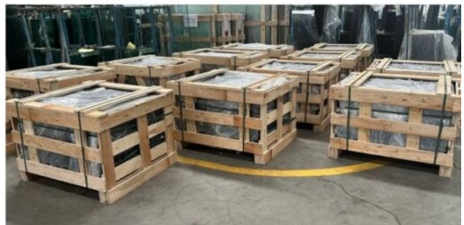
Packaging and delivery for opaque laminated glass 4+4mm

Dragon Glass also work for other types of laminated glass, such acoustic PVB laminated glass, ultra clear laminated glass, color laminated glass and so on, this is for different clients their different projects, if you have any inquiries or questions, please do not hesitate to contact us anytime .