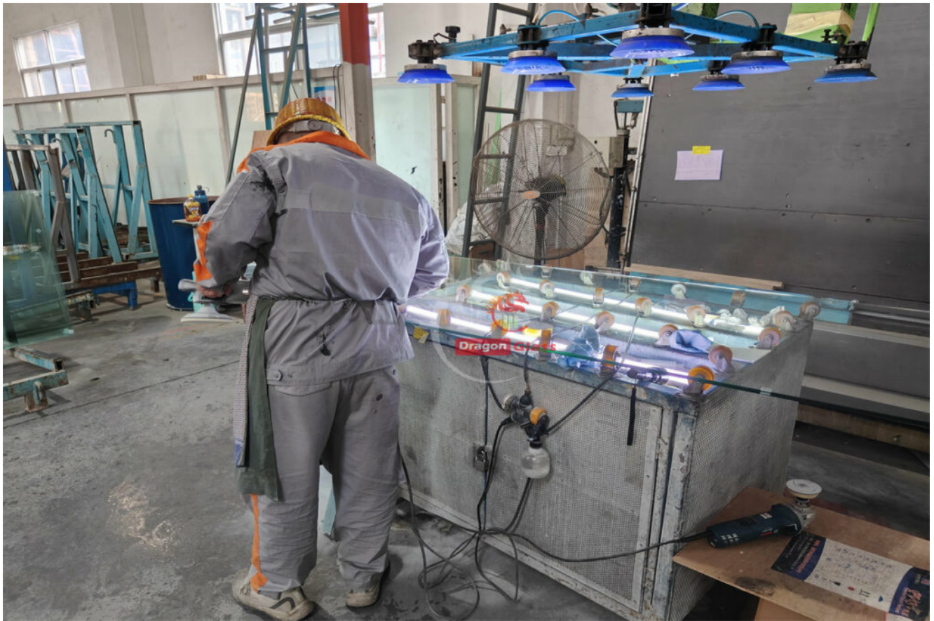
Laminated glass inspection by flash light in Dragon Glass