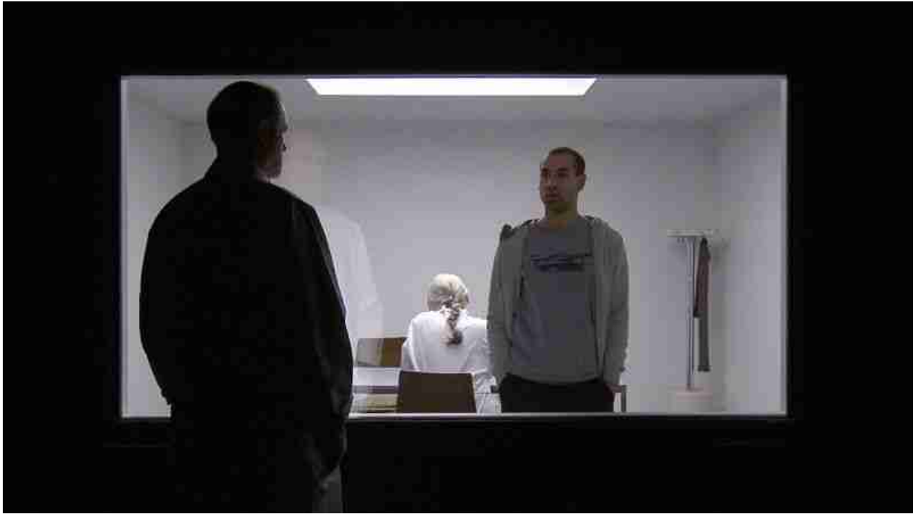
Explosion-proof two-way mirror.