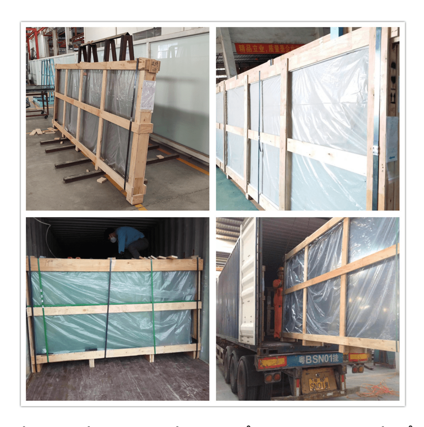
Vil du sjekke kvaliteten vår? Velkommen til å kontakte oss for å få en gratis prøve nå!