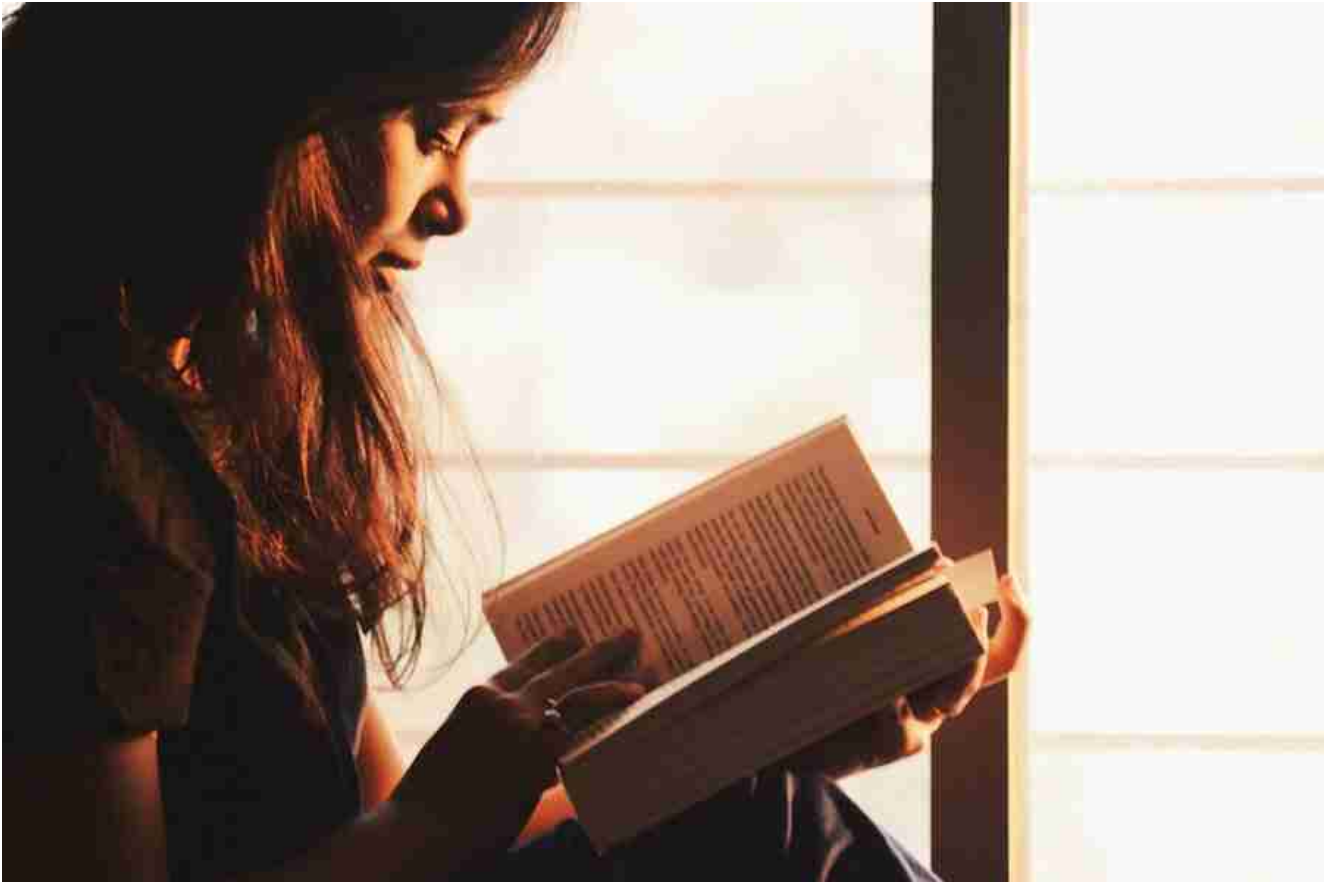
Stille lese bøker inne i lydisolerte laminert glass vindu