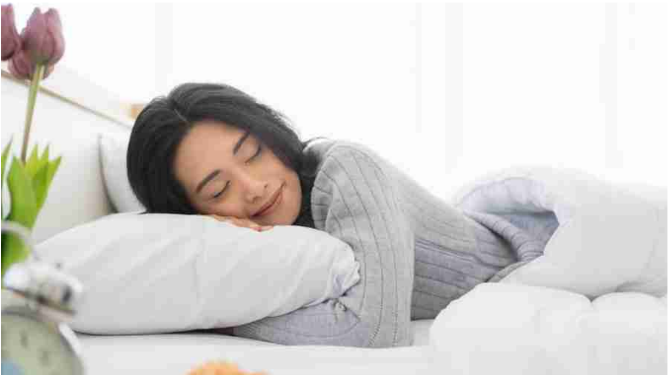
Sover som en baby i et rolig miljø som tilbys av lamineringsvinduer.