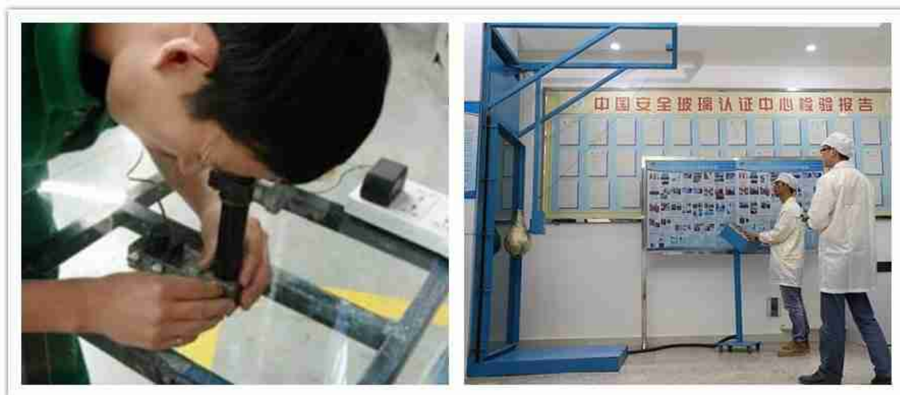
De laminert glass prosess støttesting og inspeksjon