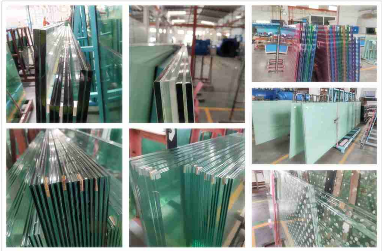
All types of laminated glass products by Shenzhen Dragon Glass.