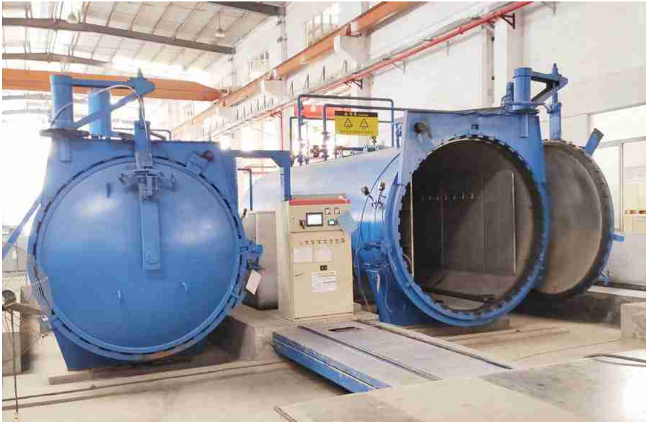
Laminert glass produksjonsmaskiner-høytrykks autoklav

interlayer(usually by PVB) and put it into a high-pressure autoclave.