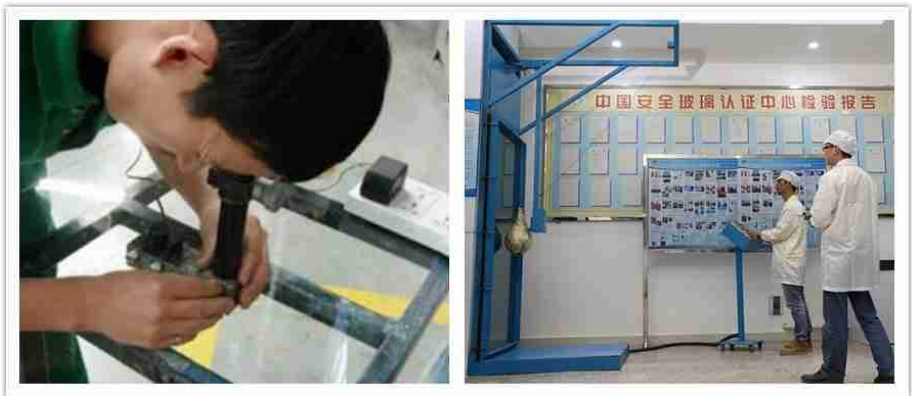
De laminert glass prosess støttesting og inspeksjon