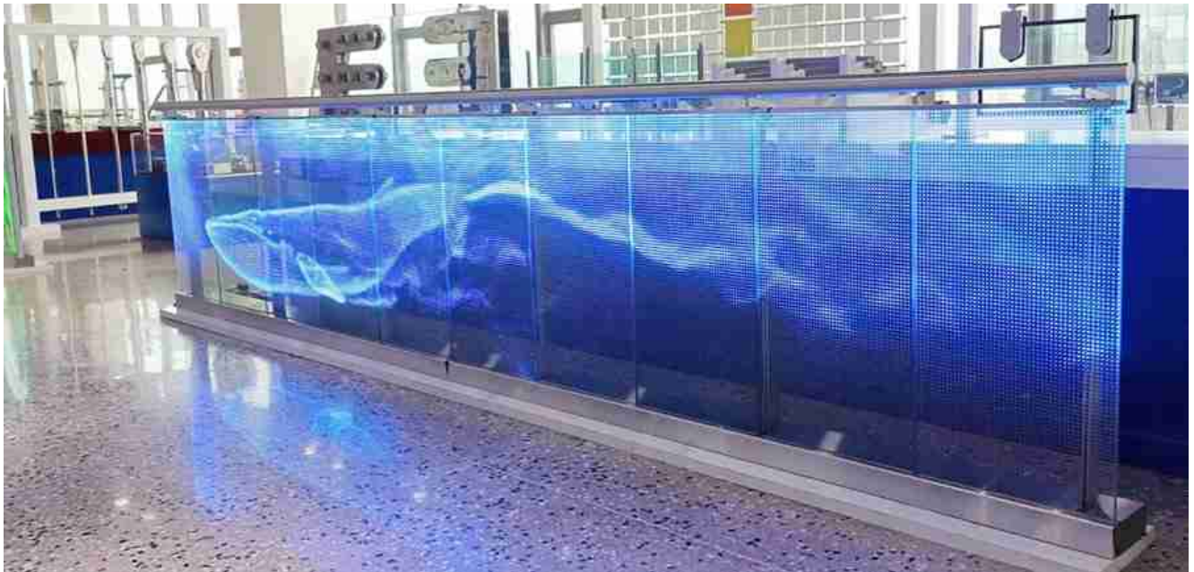
LED laminated glass for railing