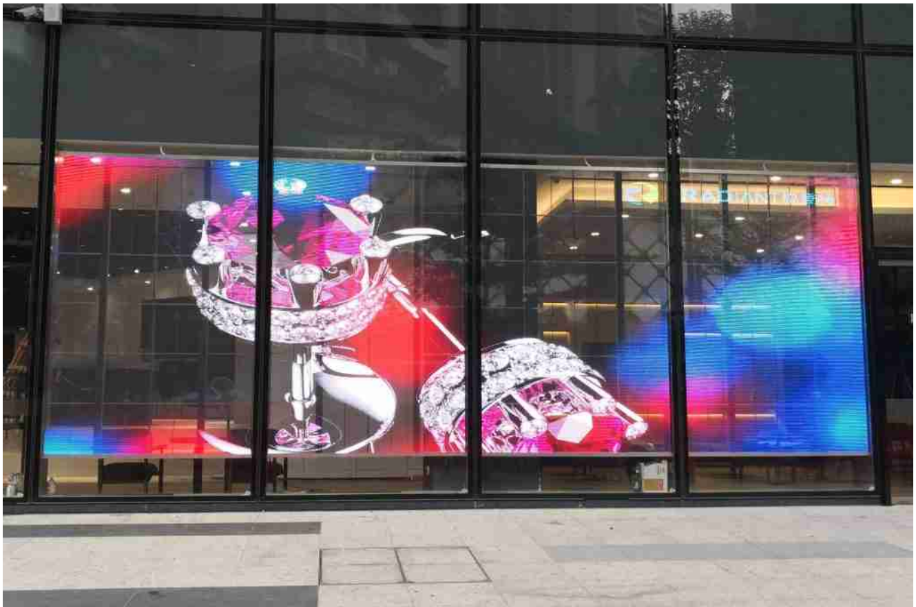
LED laminated glass for facade