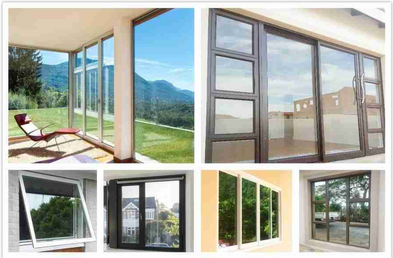
Windows low e glass applications.