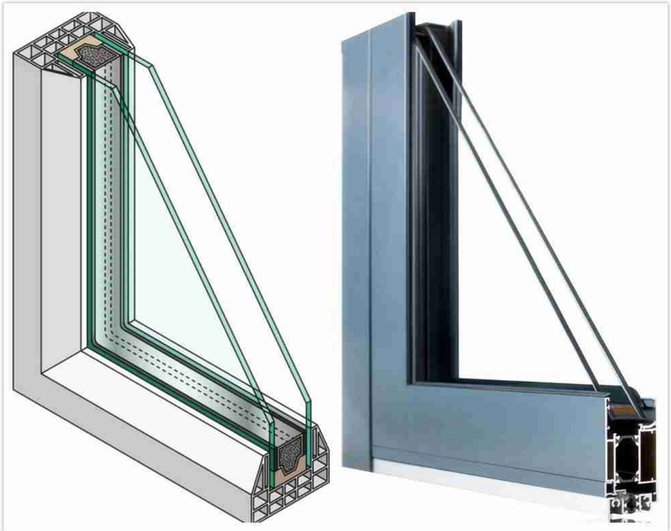
Double glazed low e window glass