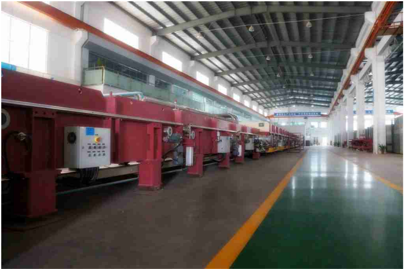
Large area low-e glass coating line.

Later the low-e glass will be sent to the cutting and grinding and tempering and insulating process to be produced as double glazed glass or triple glazed glass, etc.