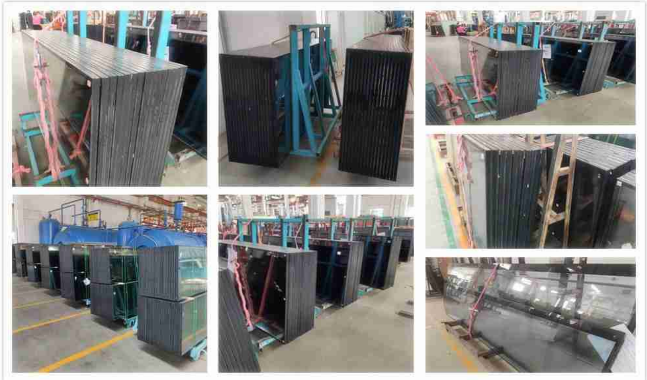
Low e windows double glass