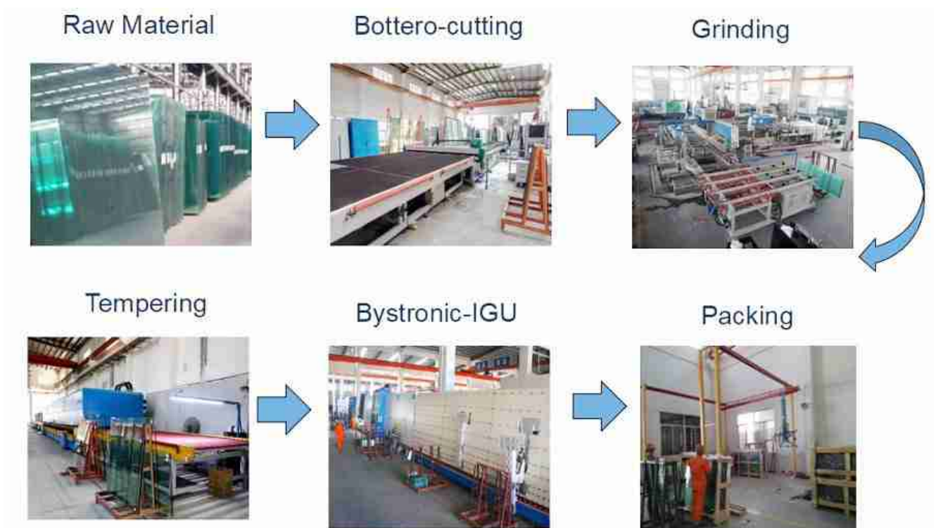
The production process for windows double glass.

Later the low-e glass will be sent to the cutting and grinding and tempering and insulating process to be produced as double glazed glass or triple glazed glass, etc.