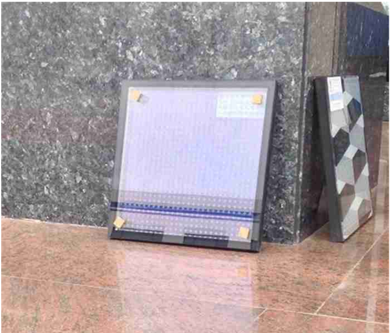
Purple reflection colors of single low-e glass

If you are using a single silver low-e glass, the film side will usually reflect a purple or reddish appearance against the sunshine(As below shows). When viewing the low-e glass on white paper, it will appear a little grey color.