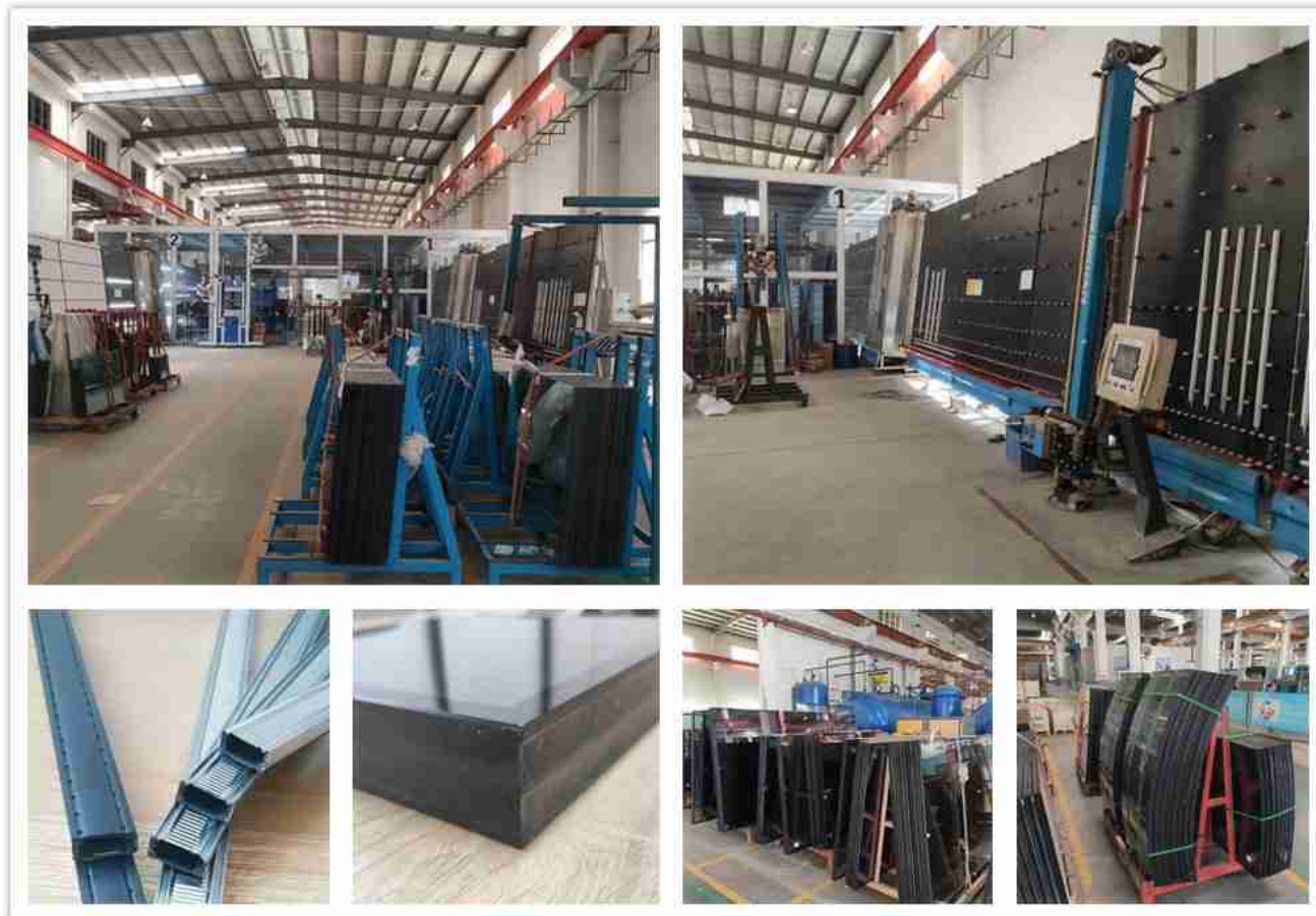
Production details of triple low e insulated glass