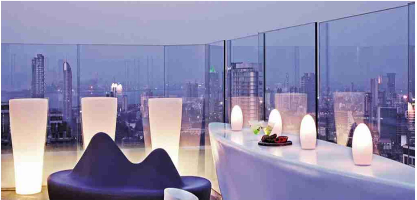
Glass railing LED lights