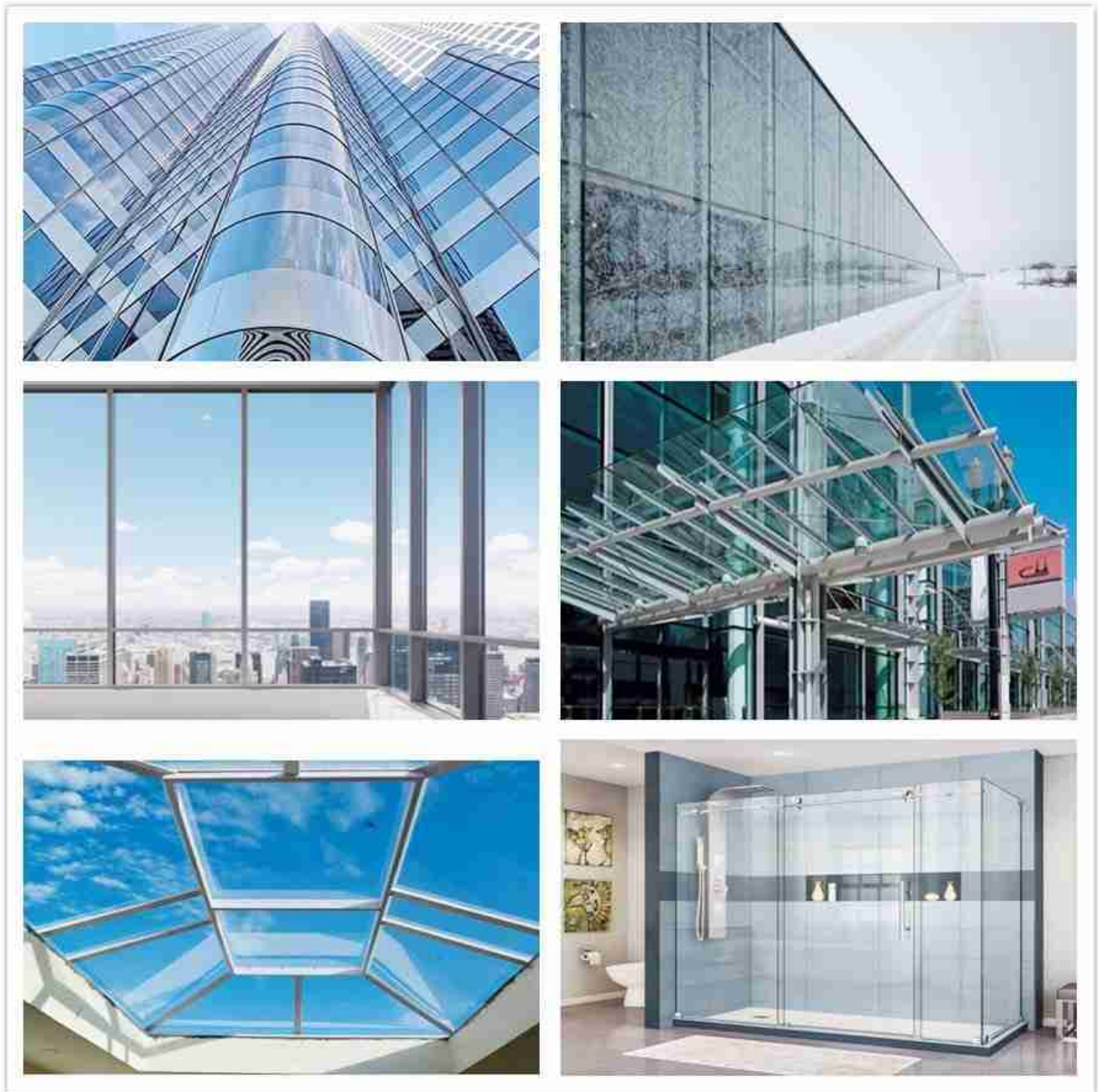
Different applications for tempered laminated glass products.