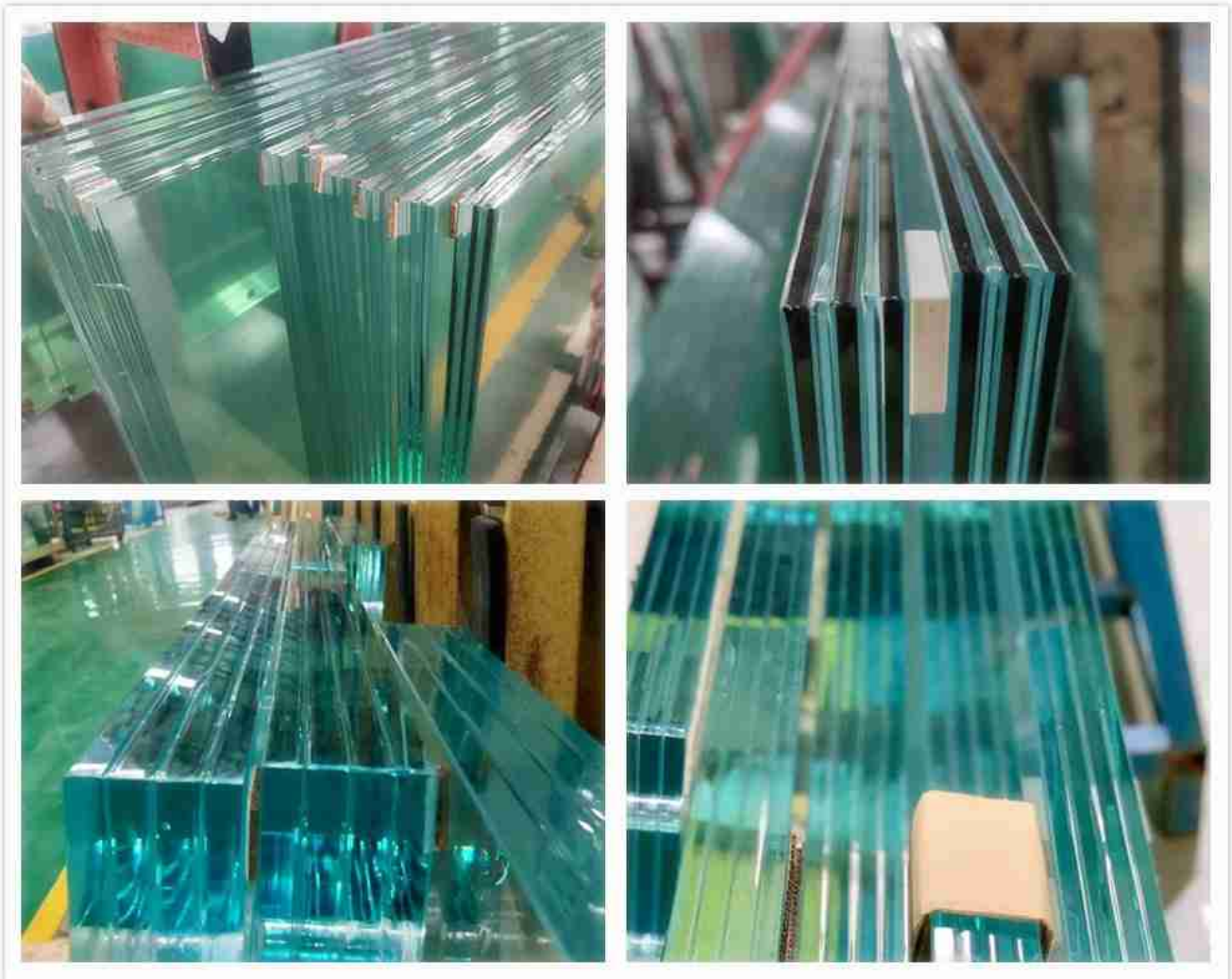
Shenzhen Dragon Glass multiple layer laminated security glass products