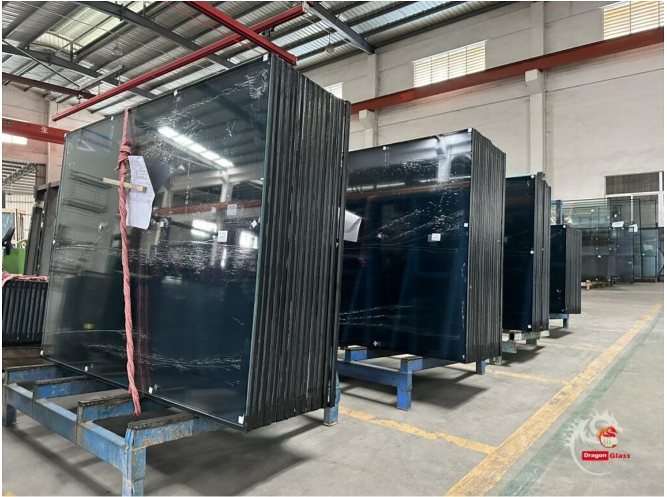
laminated insulated glass unit