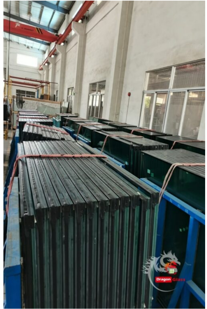
laminated insulated glass unit