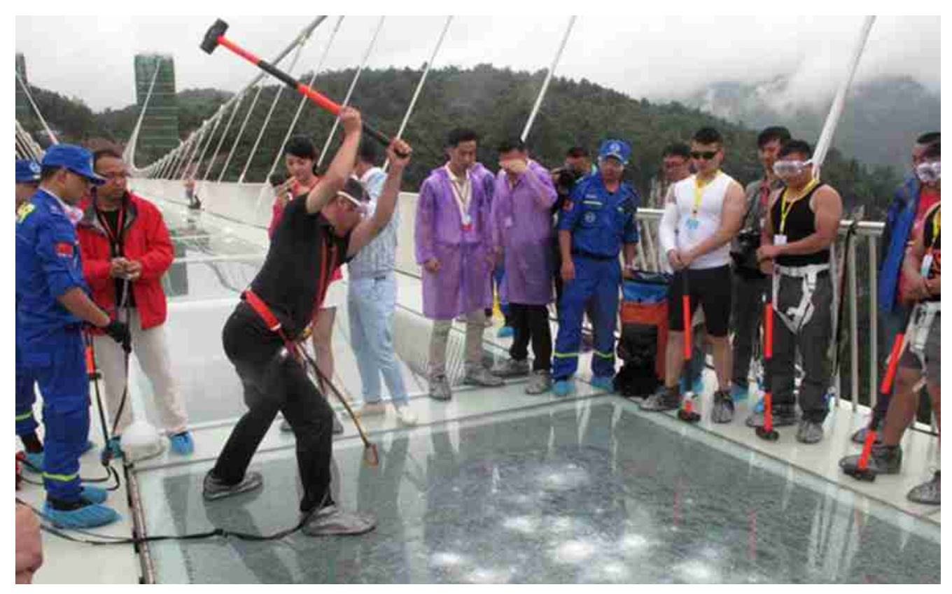
SGP laminated glass flooring enduring strong impact testing

With multiple layers of laminated glass for the floor, it can endure extremely high impact and remain unbroken. If you use <u>SGP laminated glass</u> for the floor, the strength will increase 5 times more.