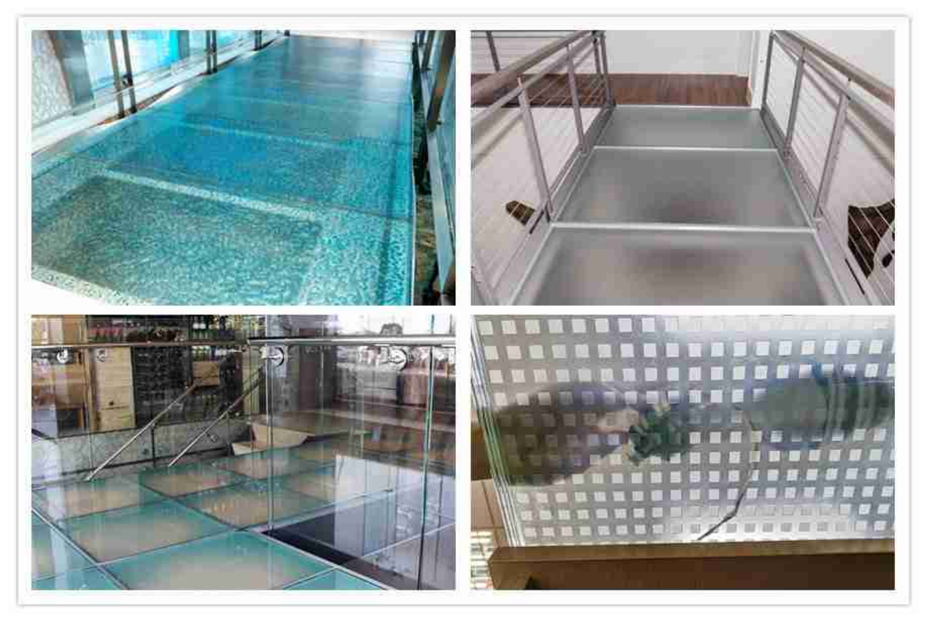
Different kinds of anti-slip patterns for laminated glass flooring