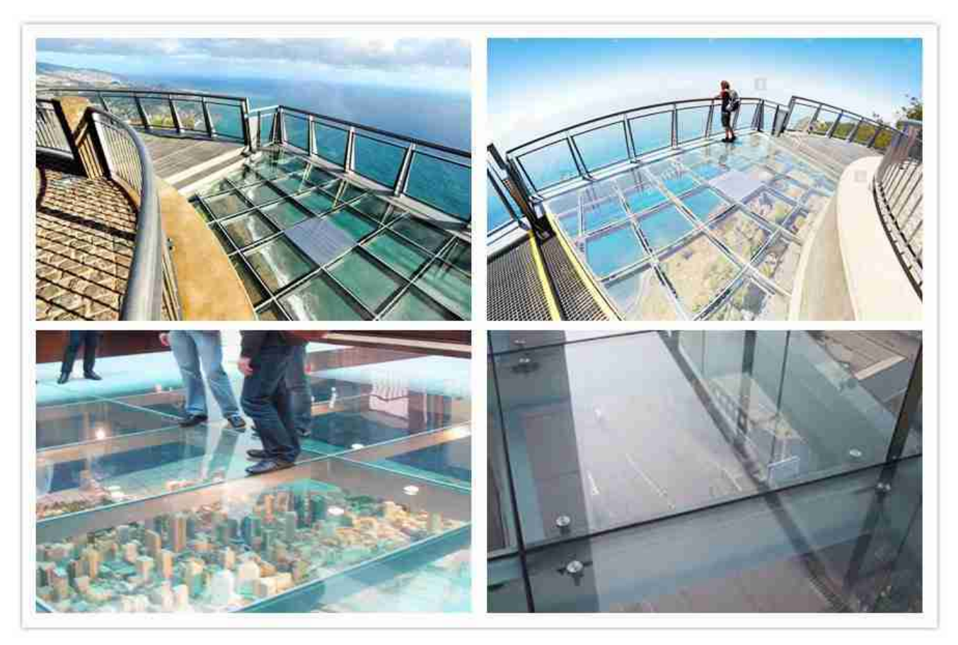
Laminated glass flooring with fantastic beauty

Take a good tour of glass for floor projects by a video here: