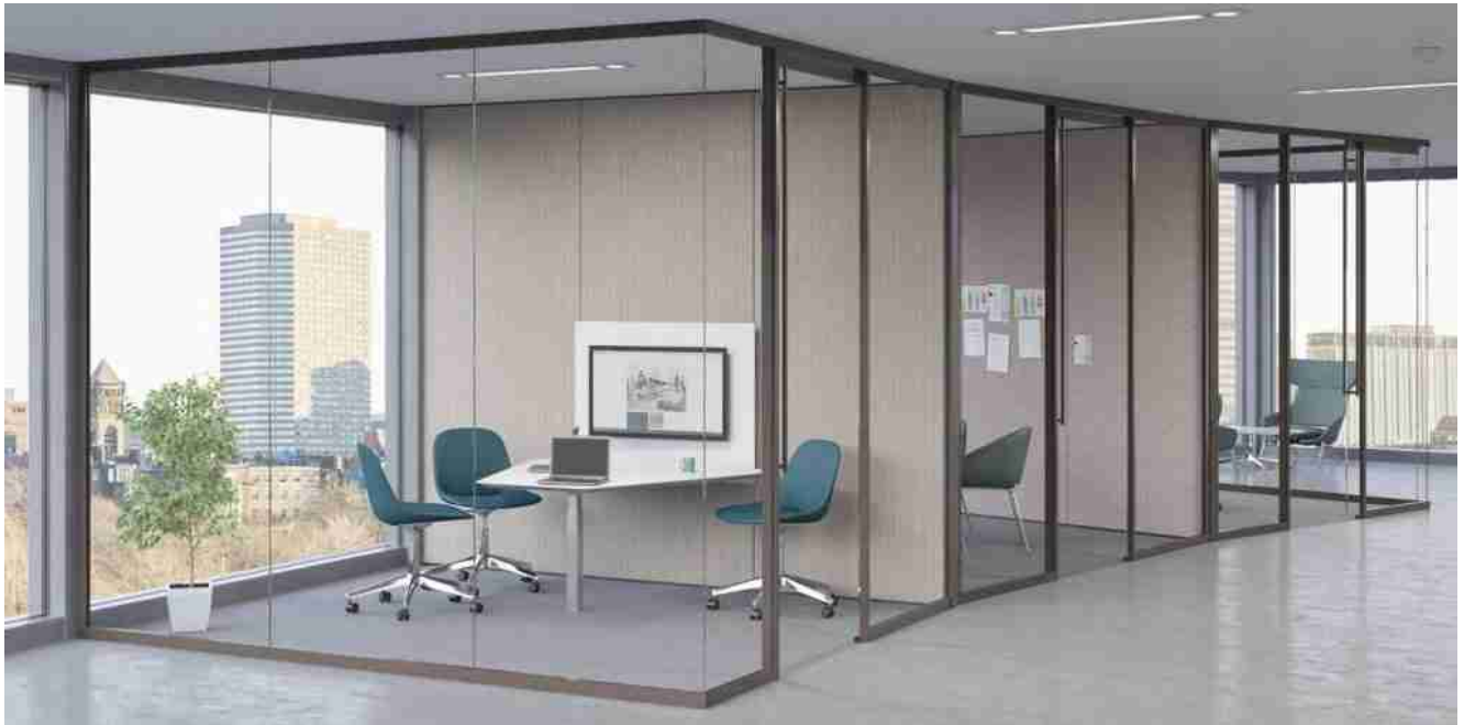
pvb laminated acoustic commercial glass partitions

Acoustic laminated glass as its high strength and superb soundproofing functions is very popular in internal glass partition or commercial glass partitions applications. As below pictures showing: