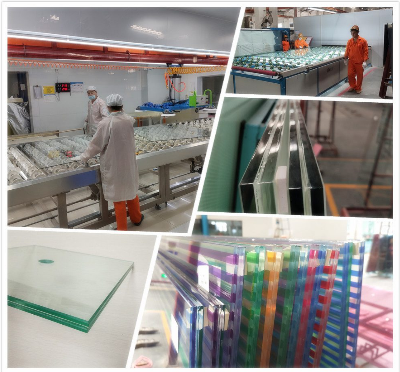
Shenzhen Dragon Glass acoustic laminated glass products.