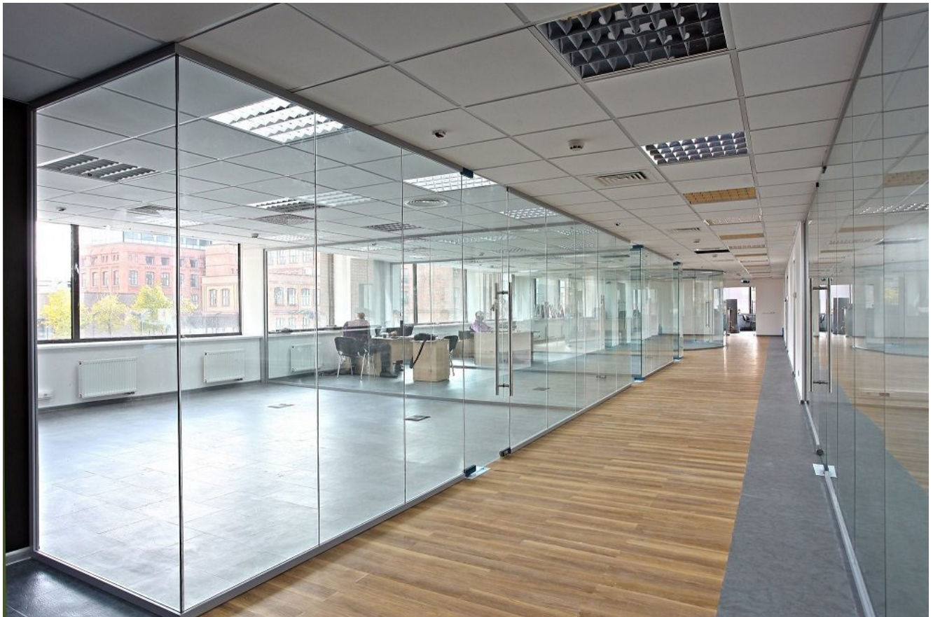
Good soundproofing internal glass partition