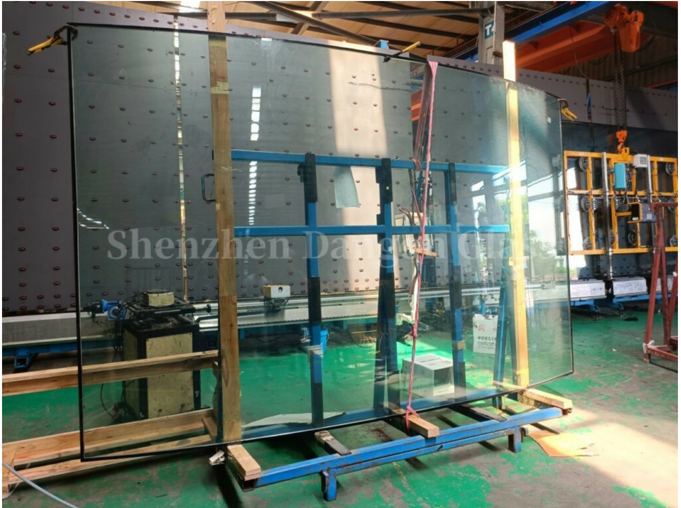
insulating windows glass