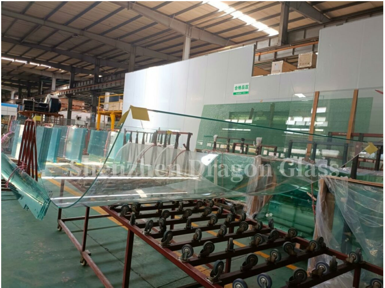
Jumbo size curved glass