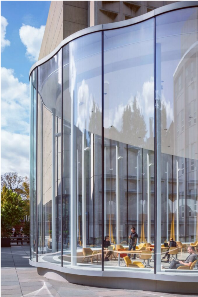
curved insulating glass windows