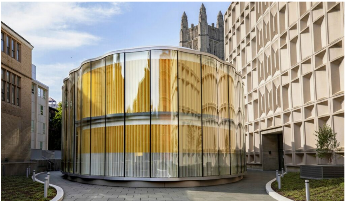
jumbo size curved insulating glass windows

How to insulate glass windows from heat? How to insulate glass windows from cold?