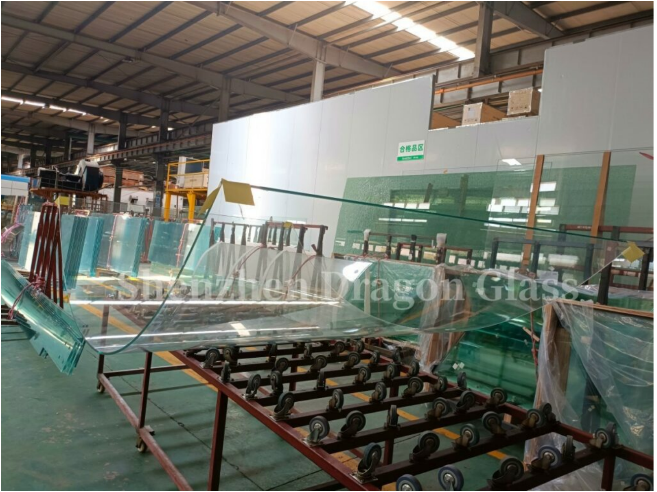
Jumbo size curved glass