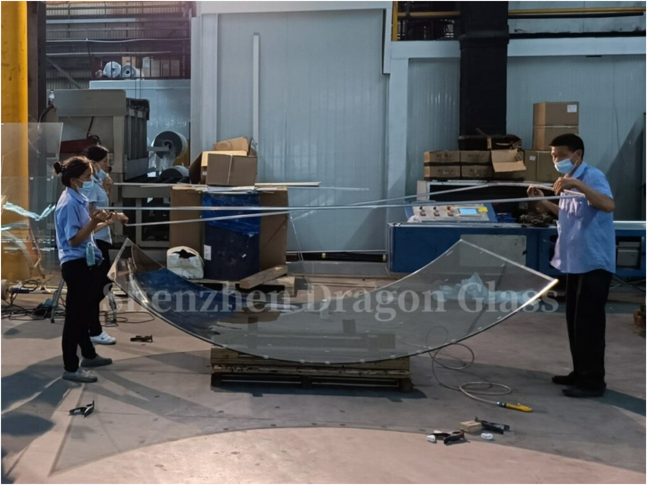
Jumbo size curved laminating glass