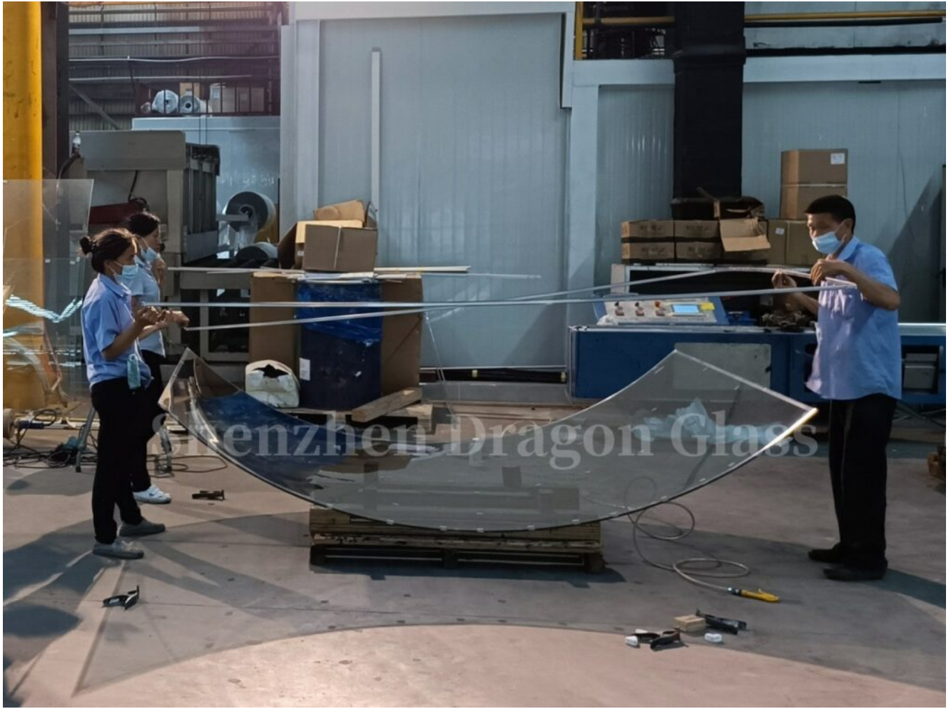
Jumbo size curved laminating glass