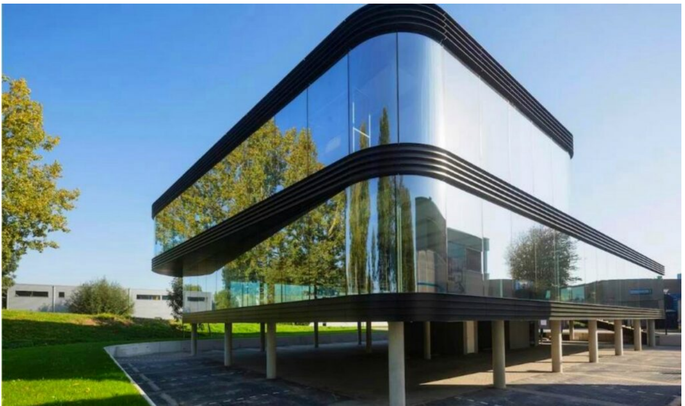
jumbo size curved insulated glass windows

Accounting for solar heat gain during the summers and substantial heat loss during winter. Effective window insulation limits heat loss and also helps regulate the temperature of the interior glass. They are also incredibly effective since they increase energy efficiency in your home.