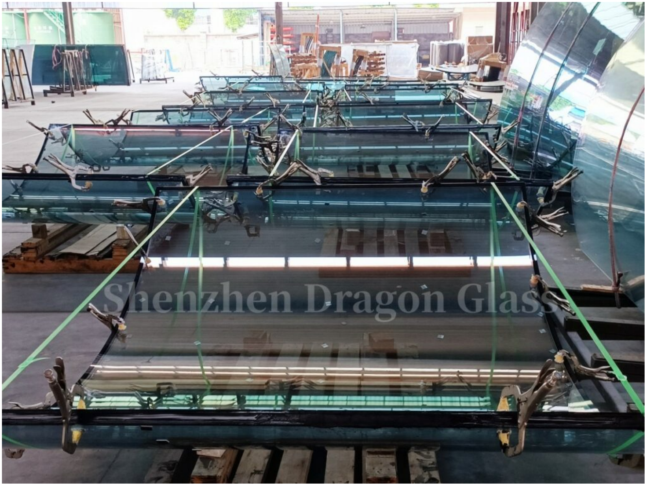
Jumbo size curved laminating glass