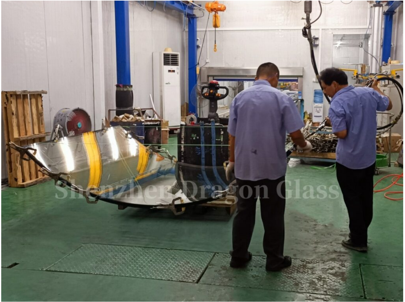
Jumbo size curved laminating glass

If you are interested in including oversized insulating glass windows on your own architectural project, just get in touch with the team at Shenzhen Dragon Glass . We can help advise on solutions, glass specifications, performance, and typical details. We can also give you an overview of what will be possible for your specific project requirements.