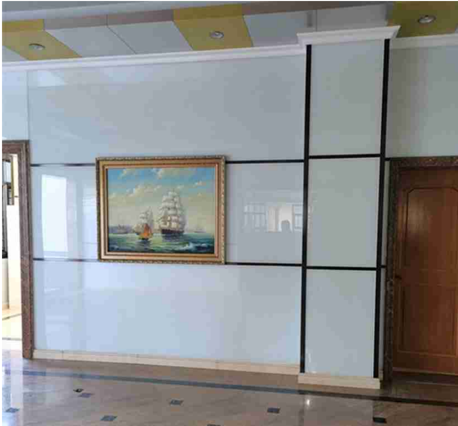
For interior glass wall panels