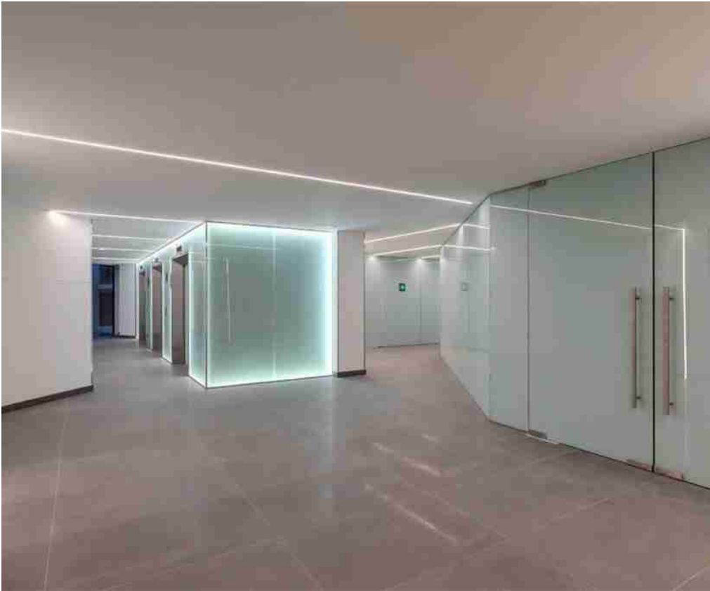
For glass partition