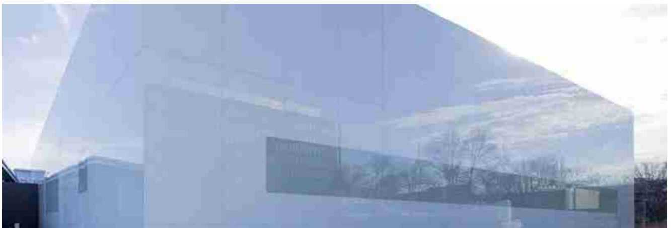
For curtain wall