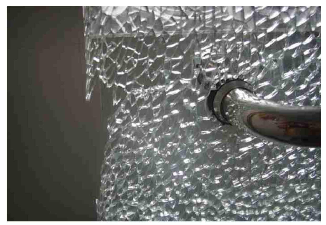
Tempered glass breakage with explosion-proof film