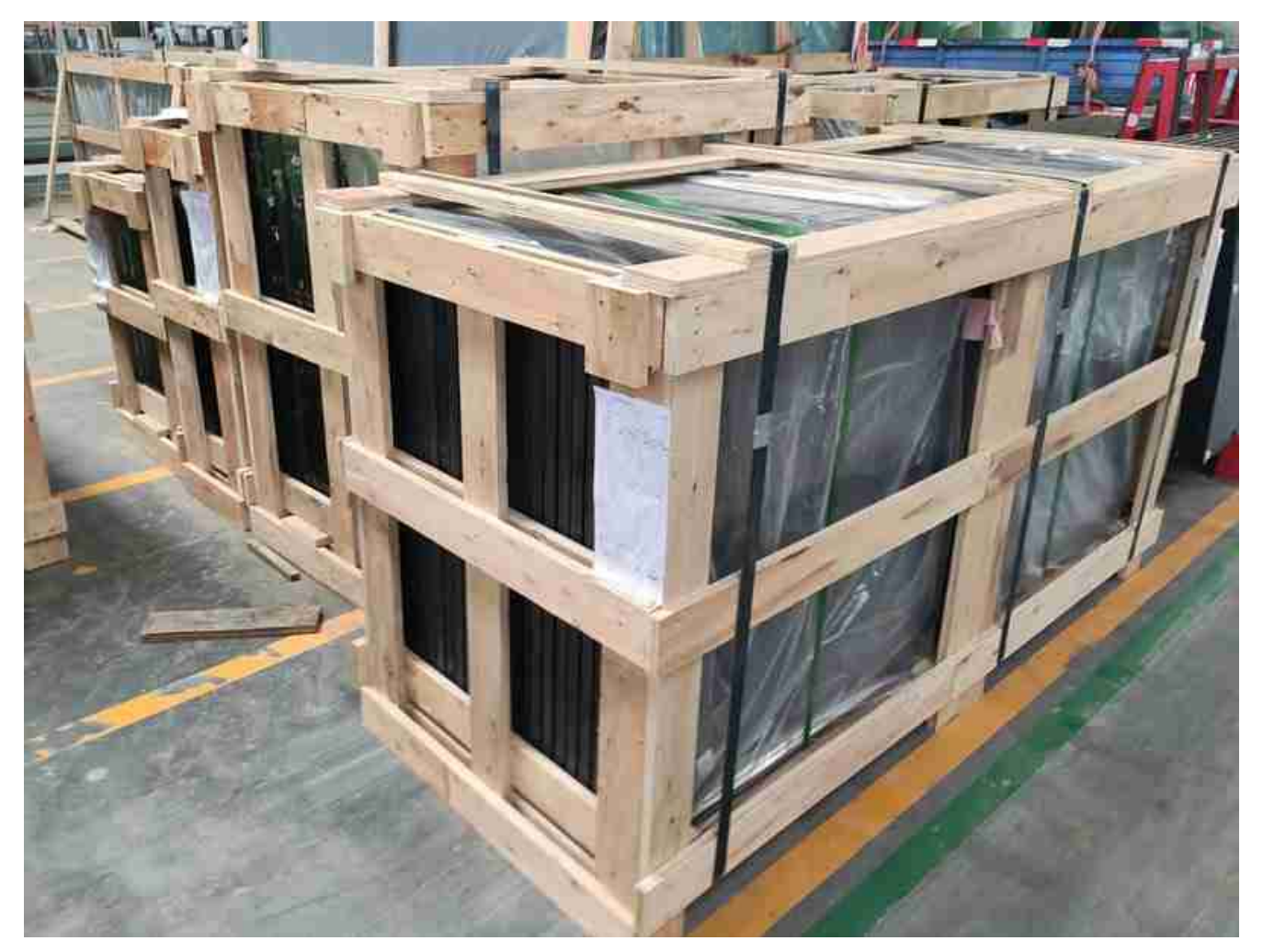
Strong plywood crates packing for tempered glass products

• Ensure that there will be no damage to the glass corners caused by bumps during transportation; Strong packing wood and methods are suggested;