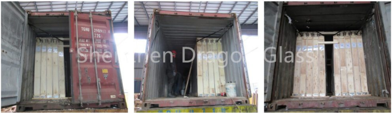
Mirror glass loading photos

photos for all our clients, and let them no worries.