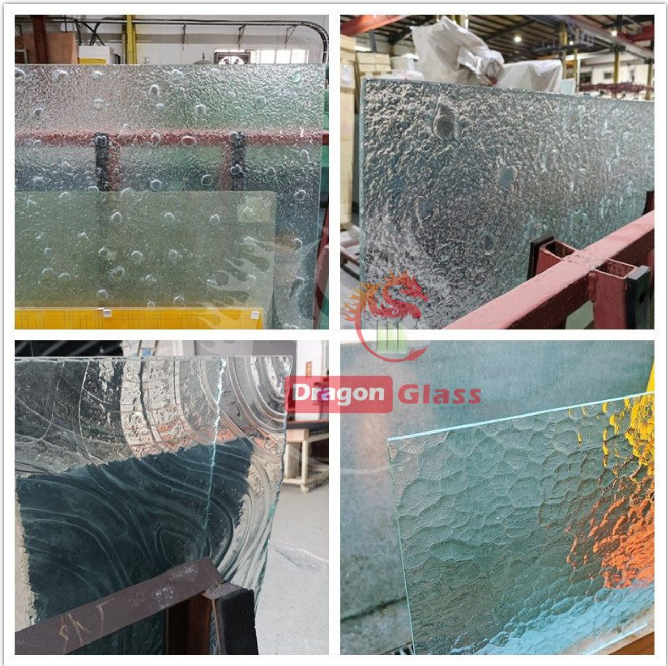
Dragon Glass Fused glass 10mm

sculptures to large wall installations. With its stunning results and endless possibilities for creativity, which is sure to be a hit among artists and home decorators alike!