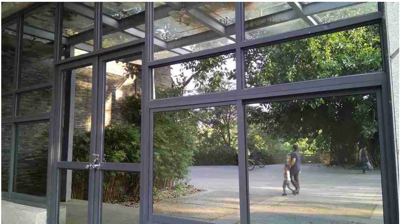
Heat reflective glass laminated windows with good privacy.