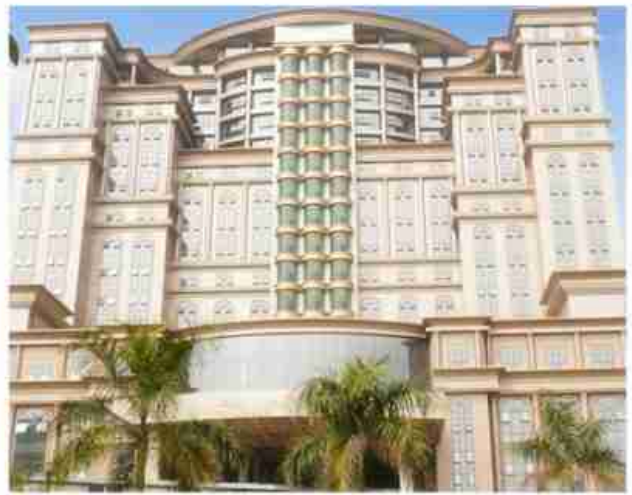
Heat reflective glass applications