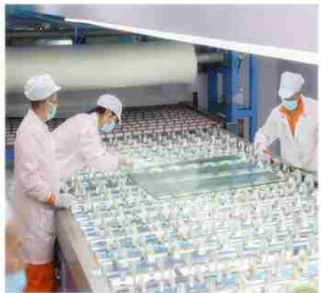
Production details for 5+5mm reflective laminated glass products.