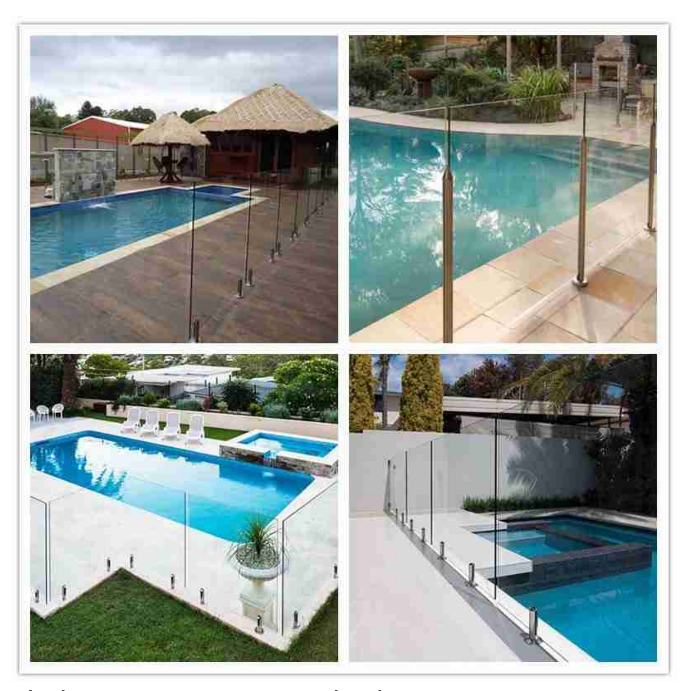
Swimming pool glass fence applications