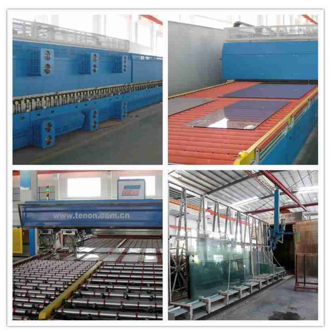
Glass pool fence panels tempering machines