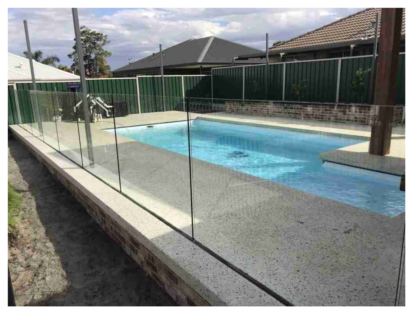
Swimming pool glass fence

This may surprise you, but a swimming pool glass fence is actually one of the easiest types of fencing to maintain. Resistant to corrosive environments around pools, spas, and oceans, it will not rust or rot over time. To clean, simply wipe down with soapy water every 8 weeks. No painting, staining, replacement, or upkeep required.