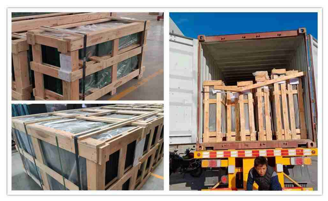
Glass pool fence cost packing