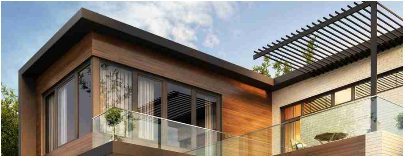
Tempered glass laminated glass for balcony price