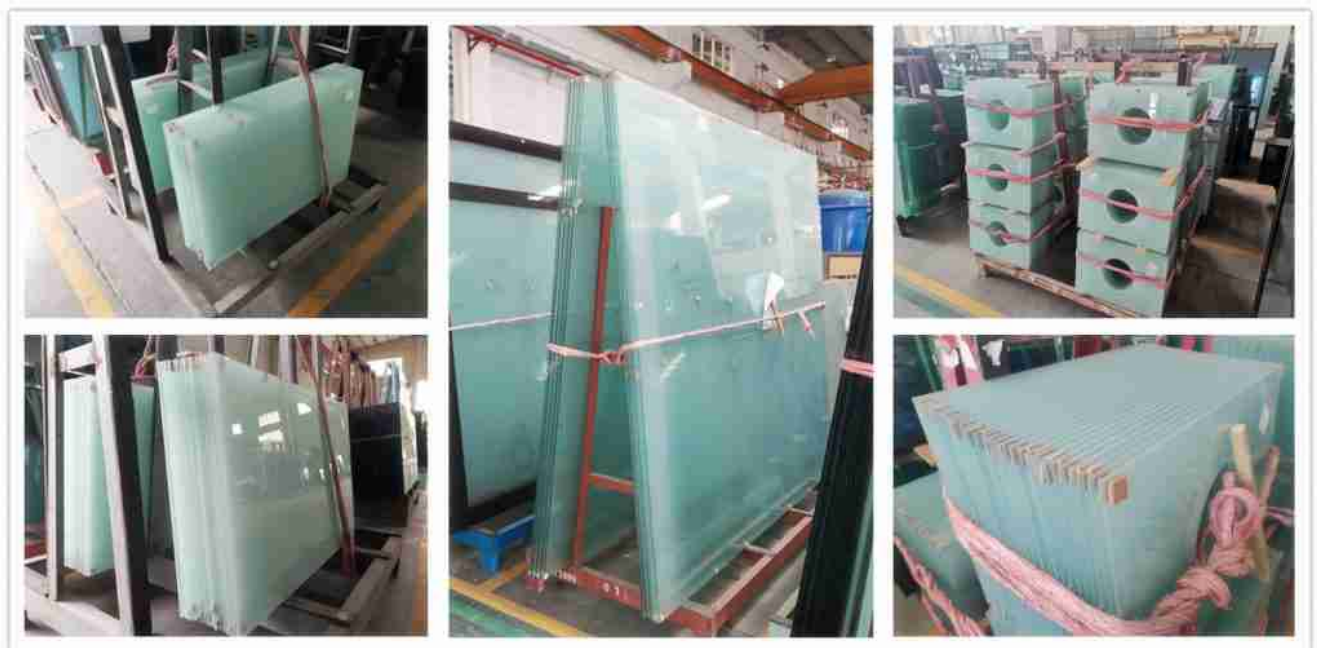
Frosted safety glass