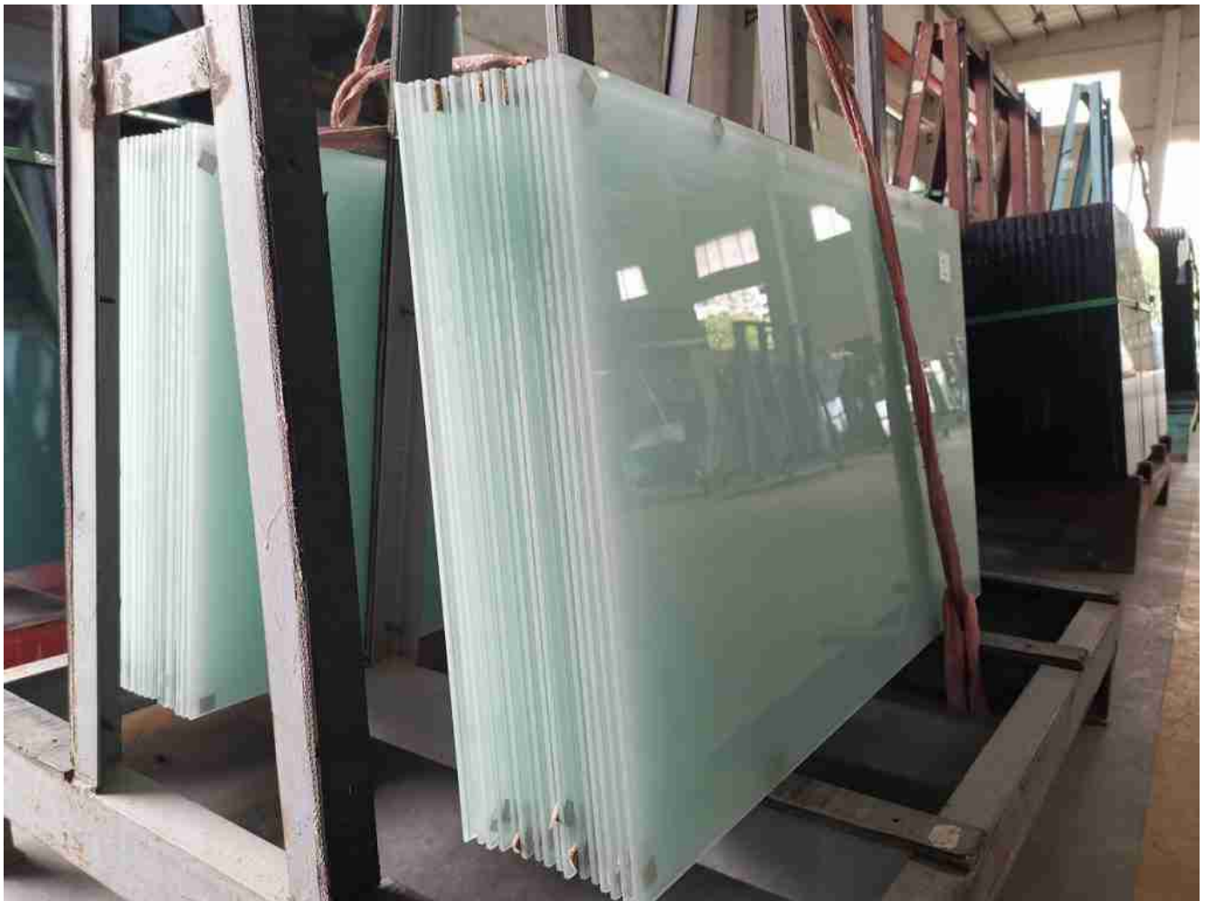
Sandblasting glass for frosted effect.

The lamination undergoing a high temperature and high pressure in an autoclave finally result in permanent combinations of the glass and PVB material. Of course, if you need to ensure higher strength and better safety, you can adopt an SGP interlayer . But if you need to have mesh or wire to be laminated inside the laminated glass, you could use EVA interlayer , normally this will be adopted in interior designs products.