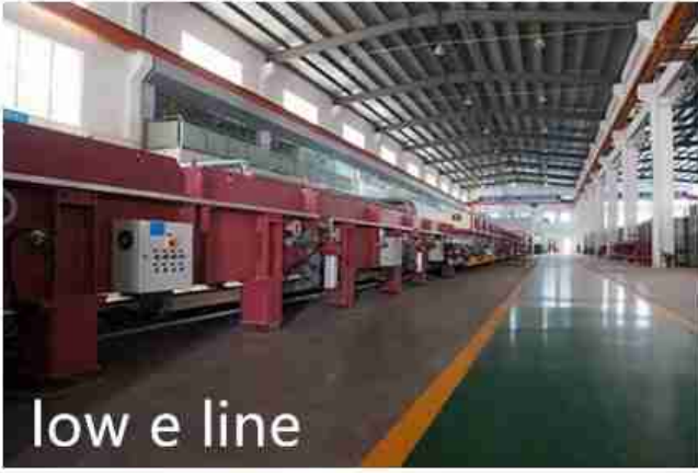
low e line