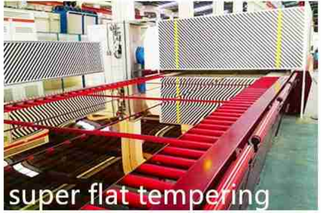
super flat tempering