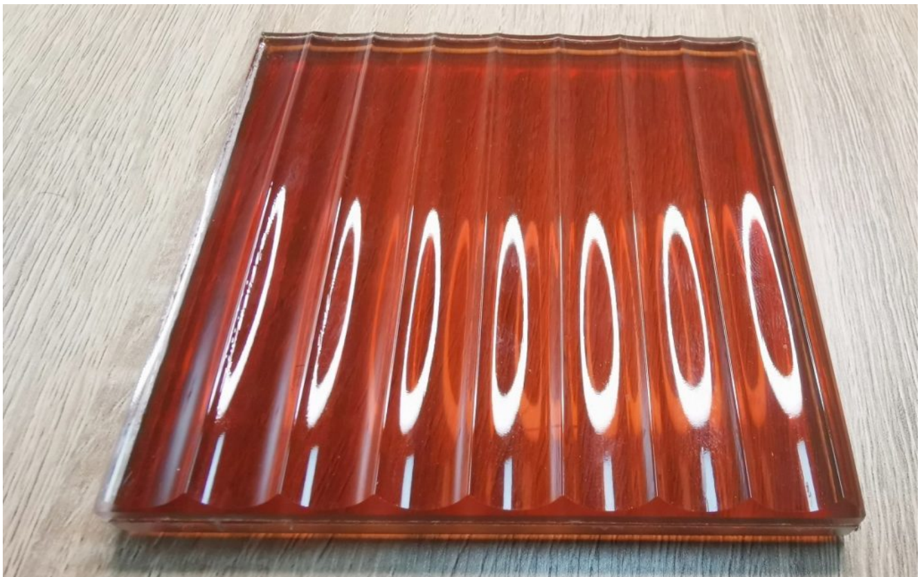
Bronze fluted glass lamination design