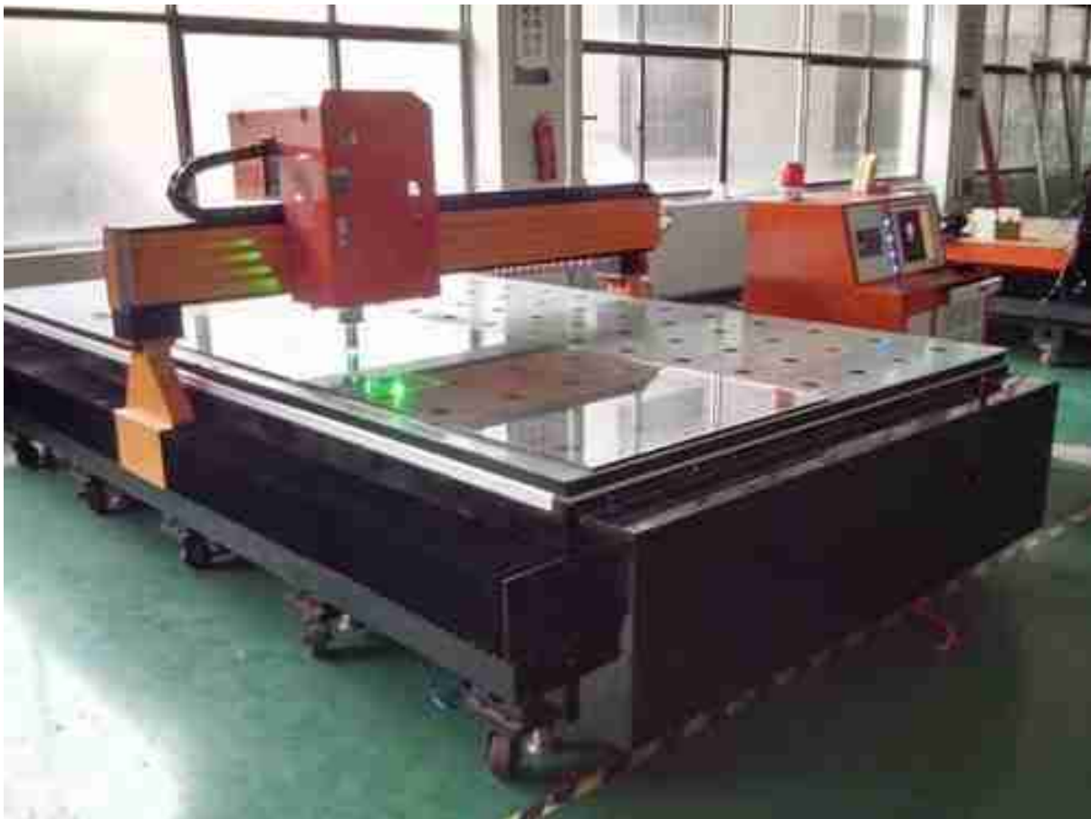
Carving glass machines

2, [REDACTED] produced by glass engraving machines. Firstly design the patterns as clients need in CAD drawing and input into the computer, later transform the patterns into CNC engraving glass machines. The engraving machines will carve the glass and polish the lines to form the exactly designed patterns. In this way, you can realize all your fluted glass texture designs.