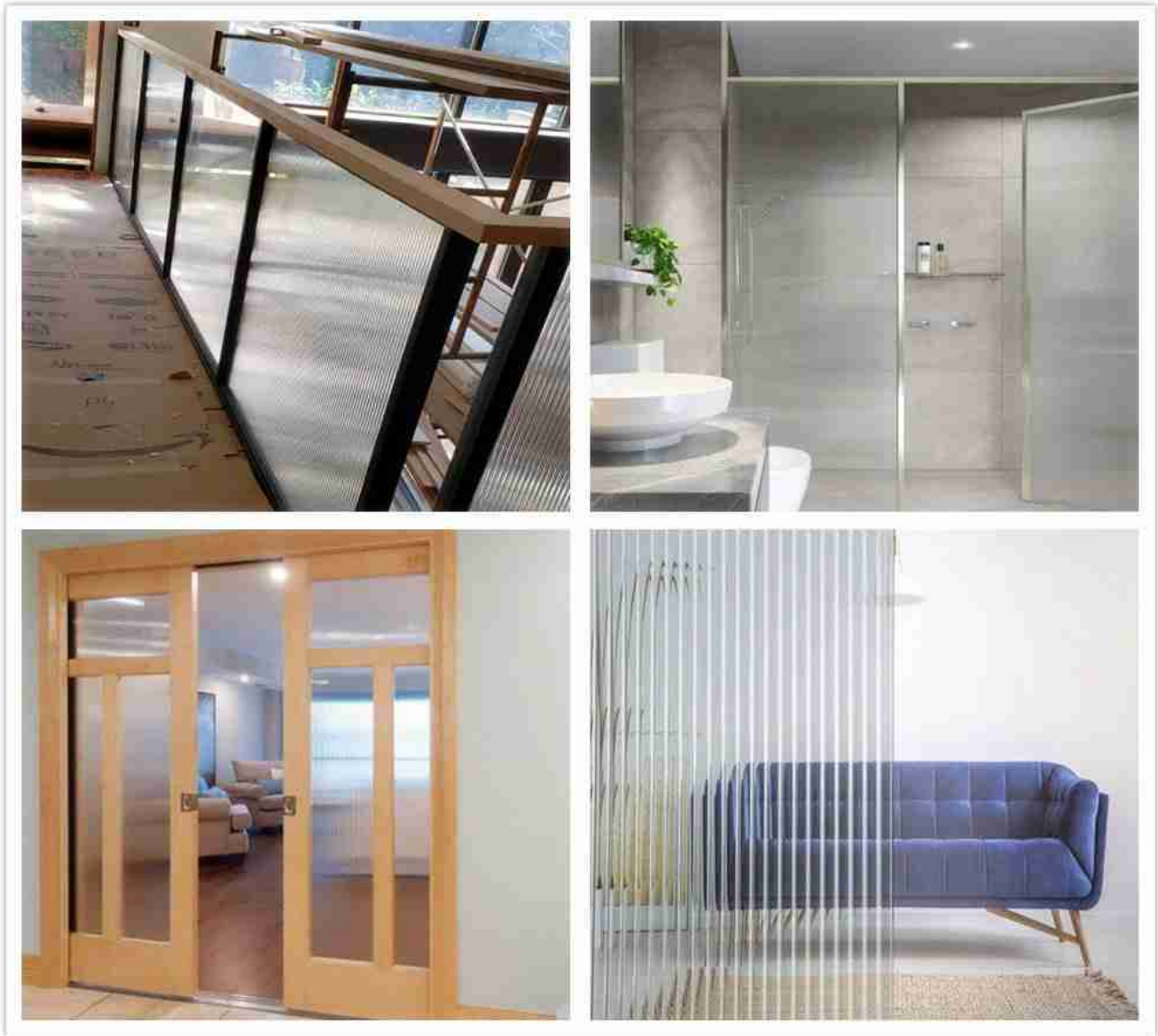
Reeded glass applications for railing, shower screen, doors, partitions, etc