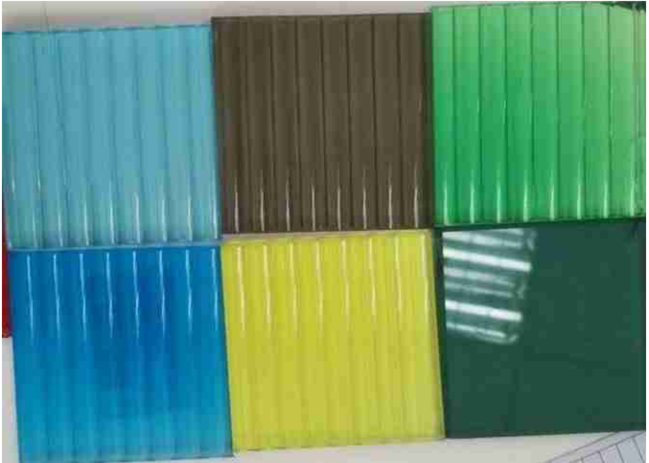
Colored pvb laminated reeded glass