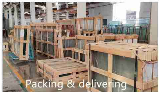
Packing & delivering

Shenzhen Dragon Glass produce double glazed curved glass window products according to strict QC system