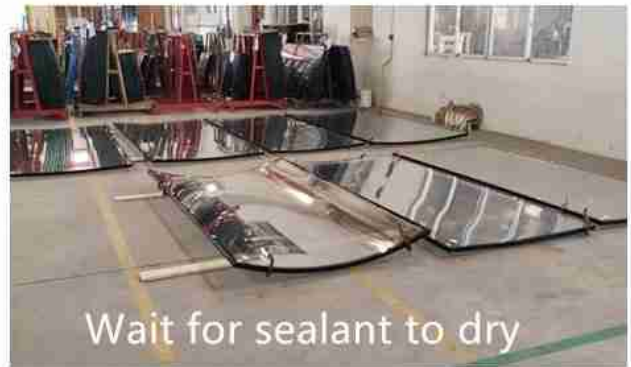
Wait for sealant to dry