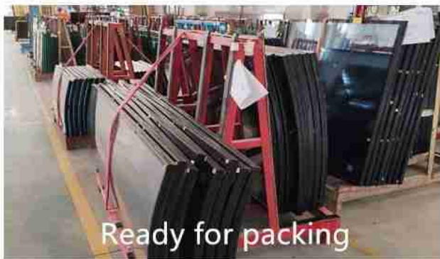
Ready for packing