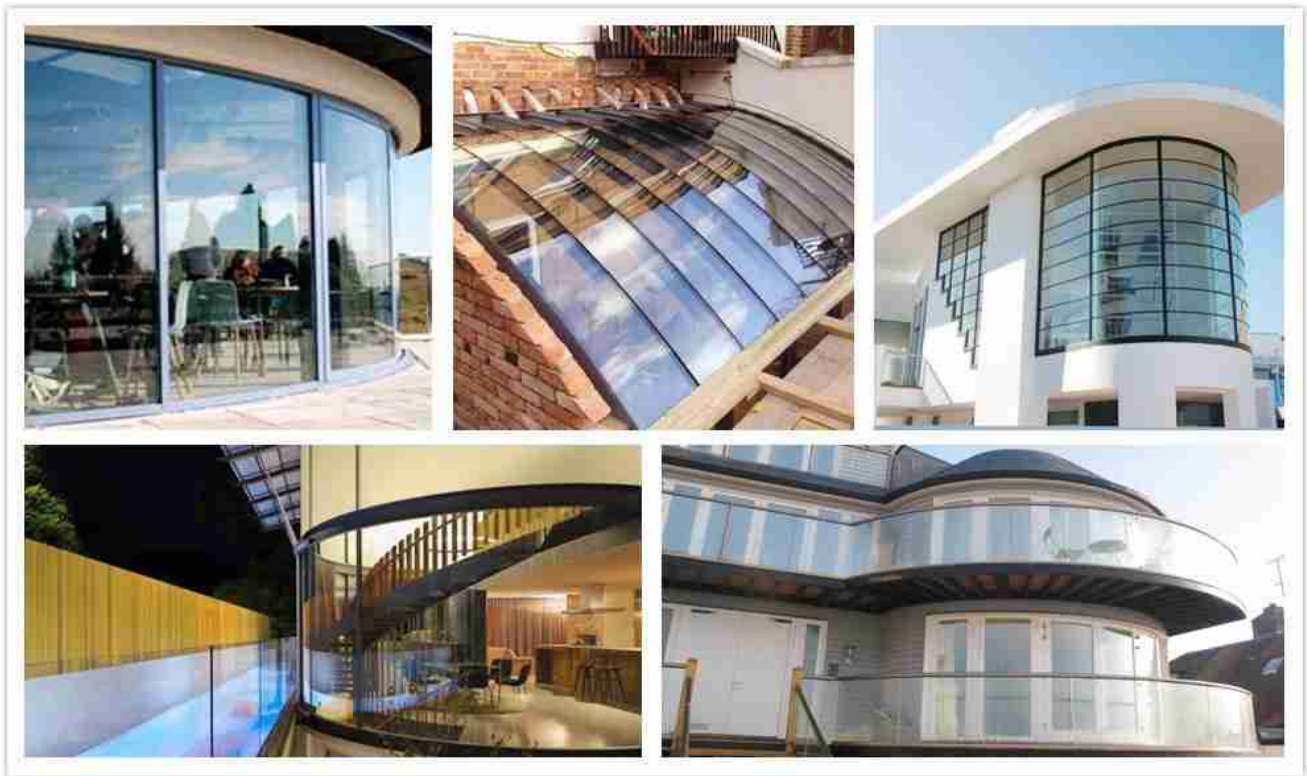
Curved glass windows designs