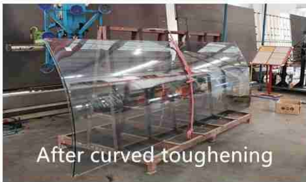
After curved toughening