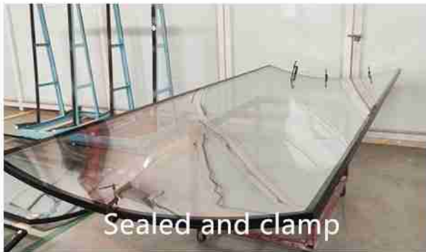
Sealed and clamp