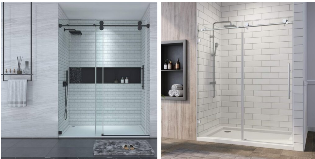
10mm ultra clear crystal tempered bathroom door glass

making it resistant to shattering under stress. It's also easy to clean and resistant to corrosion, which is important for bathroom environments that deal with humidity and water exposure.