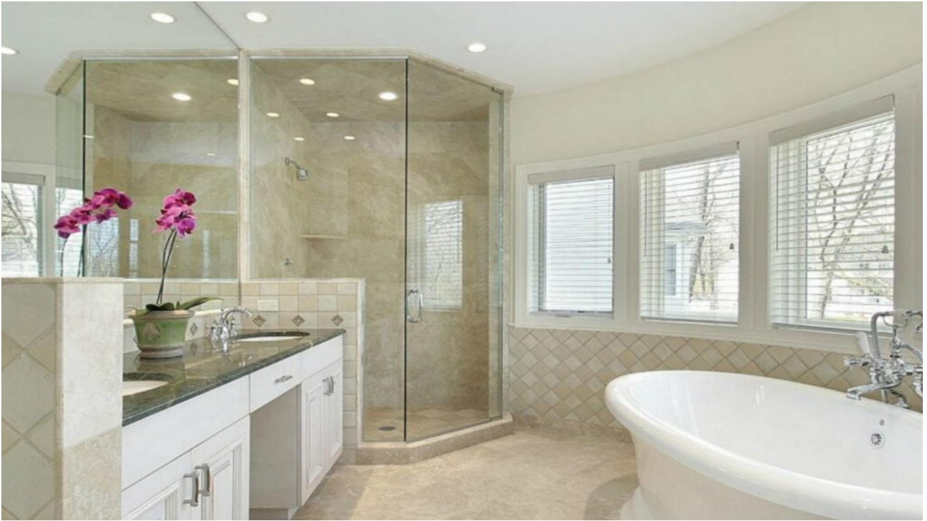
10mm ultra clear crystal tempered bathroom door glass