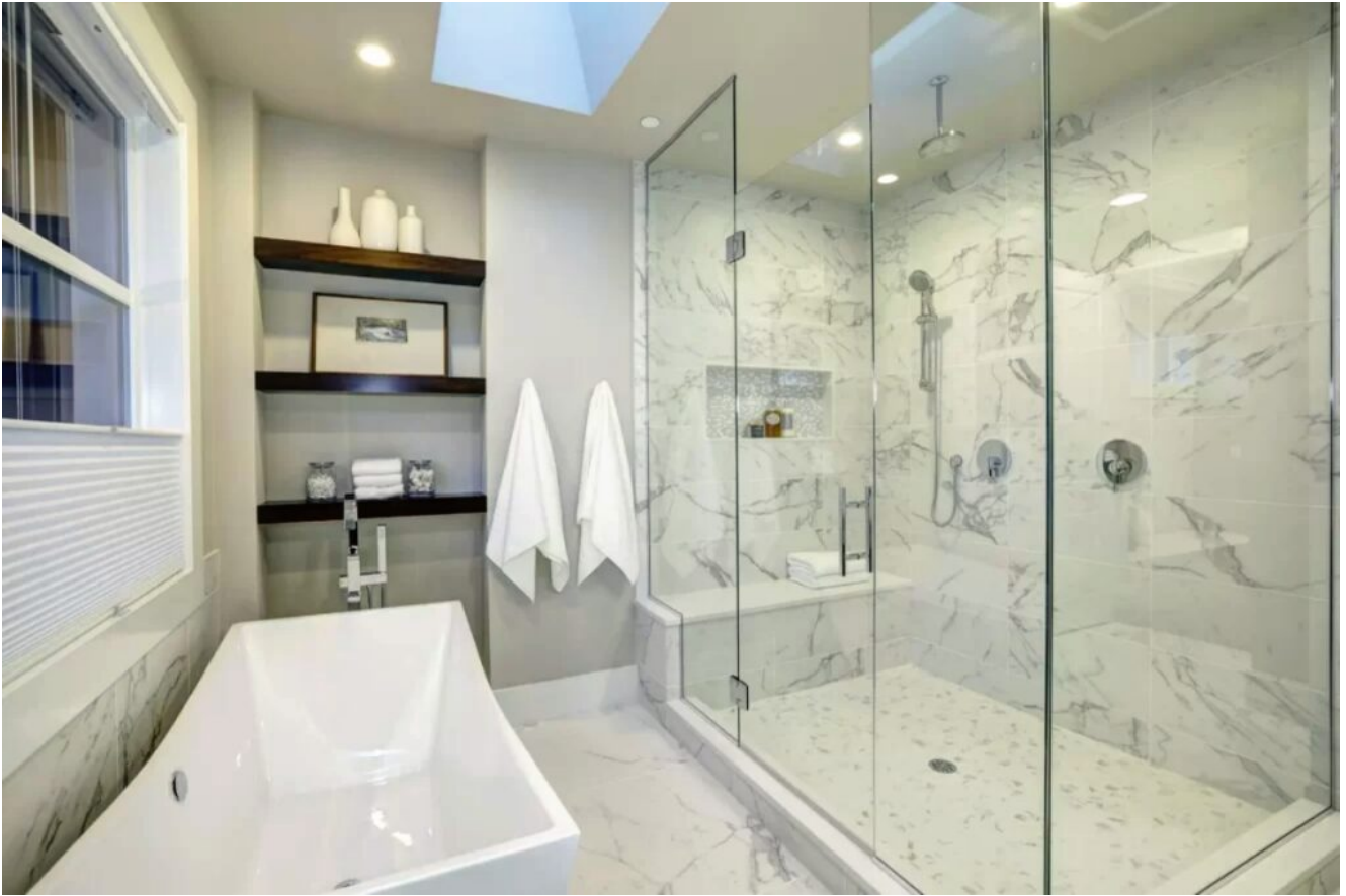
10mm ultra clear crystal tempered bathroom door glass