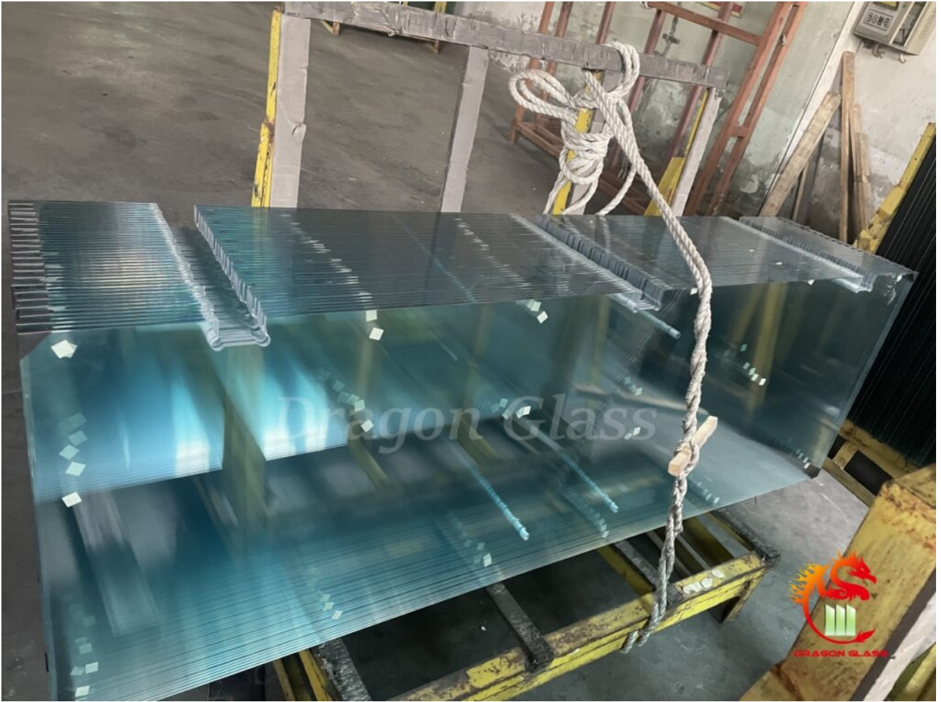
10mm ultra clear crystal tempered bathroom door glass