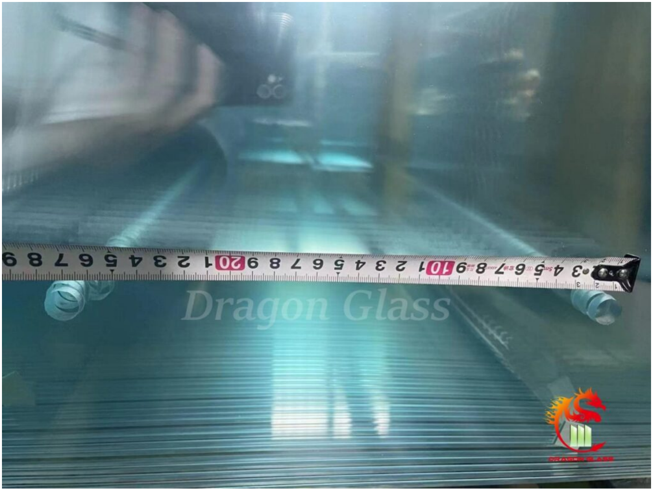
10mm ultra clear crystal tempered bathroom door glass