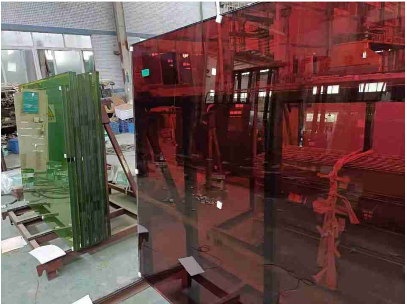
Red laminated glass