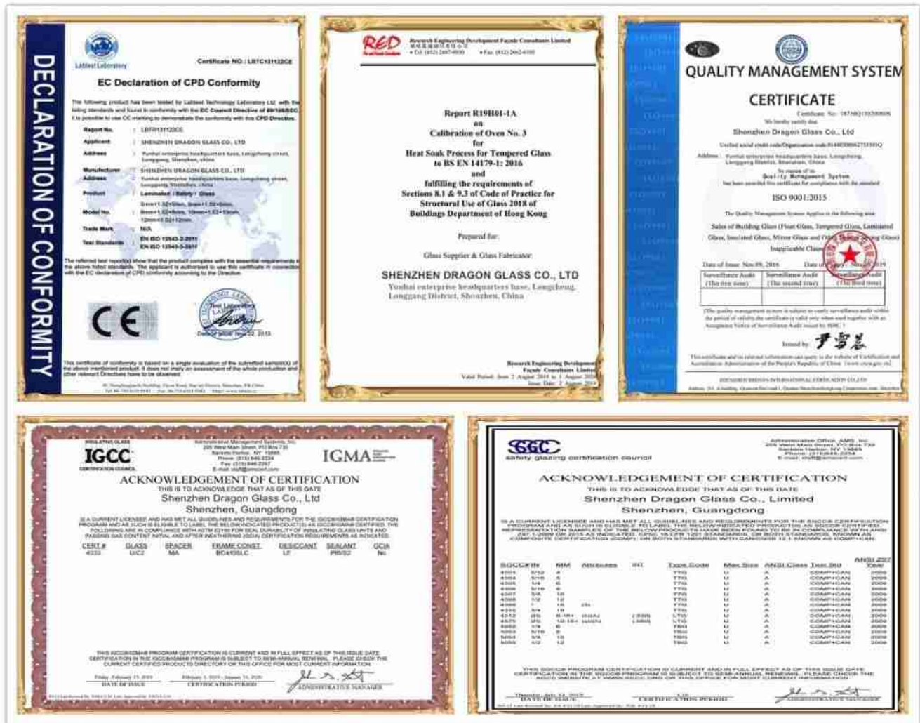
Shenzhen Dragon Glass certifications