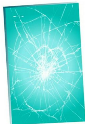
Laminated Annealed Glass

Shatters completely under high levels of impact energy, and few pieces remain in the frame