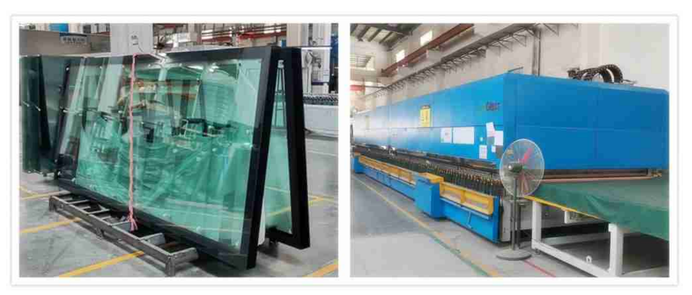
Ceramic frit glass for metrol screen glass door

12mm toughened ceramic frit glass is using 12mm clear float glass, cut to custom sizes and then grind the edges, later print the black design gradient color on the 12mm glass by <u>ceramic frit printing process</u> before sending to toughening machines. Enduring the high temperature in toughening machines, the ceramic frit printing ink will adhere to the glass surface permanently. Without fading away colors afterward.