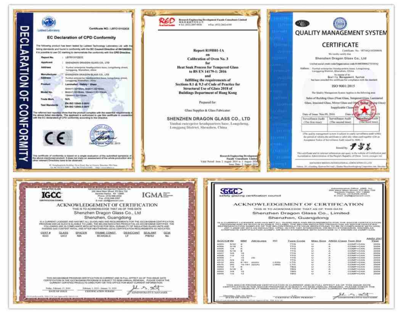
<u>Shenzhen Dragon Glass</u> certifications.