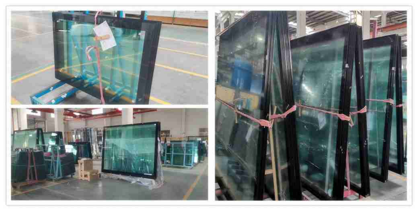
Gradient metro glass door products details.