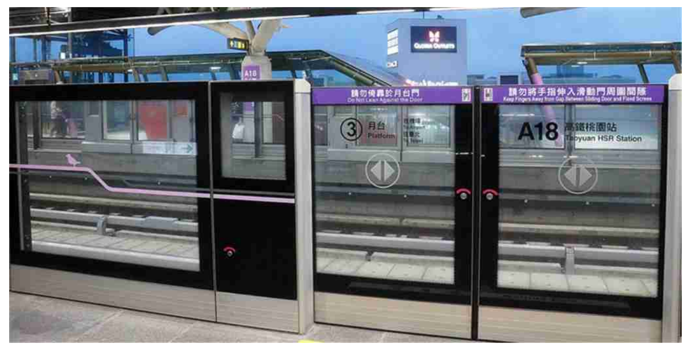
12mm toughened gradient design ceramic frit glass for metro platform glass door

12mm toughened ceramic frit glass is using 12mm clear float glass, cut to custom sizes and then grind the edges, later print the black design gradient color on the 12mm glass by <u>ceramic frit printing process</u> before sending to toughening machines. Enduring the high temperature in toughening machines, the ceramic frit printing ink will adhere to the glass surface permanently. Without fading away colors afterward.