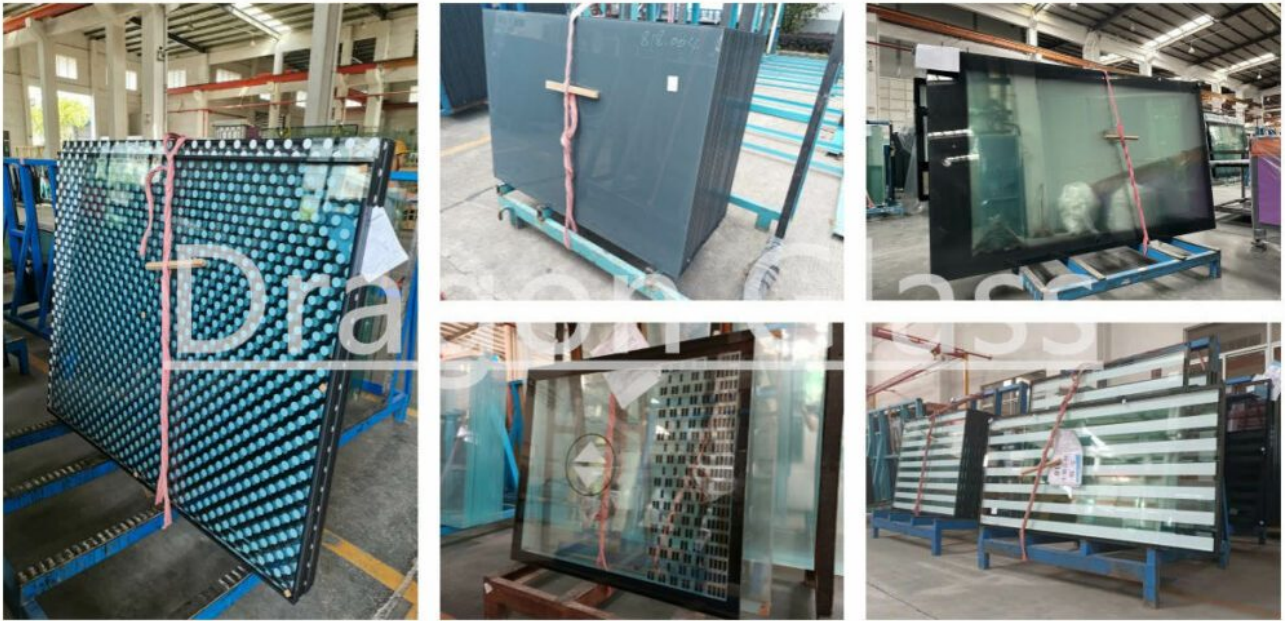
Decorative ceramic frit double glazing units