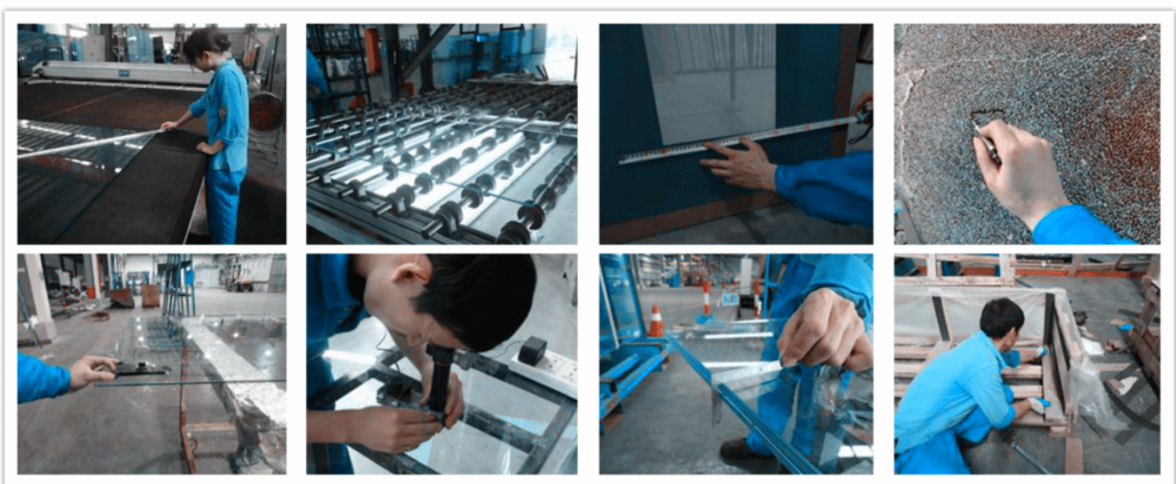
Strict quality control system.