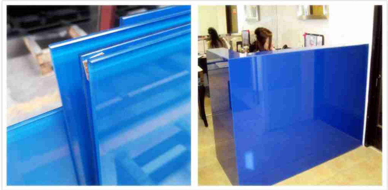
Blue glass wall panel decor

Blue color 6mm clear tempered+1.52PVB+6mm clear tempered ceramic frit glass wall panel is using one panel of 6mm clear tempered glass and the other 6mm clear tempered frit glass with blue color to form a “sandwiched” structure with 1.52PVB interlayer. The lamination is undergoing a high temperature and high pressure in an autoclave.