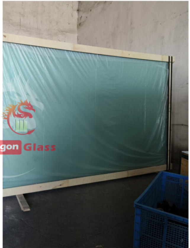
Stocks and packing for green reflective glass