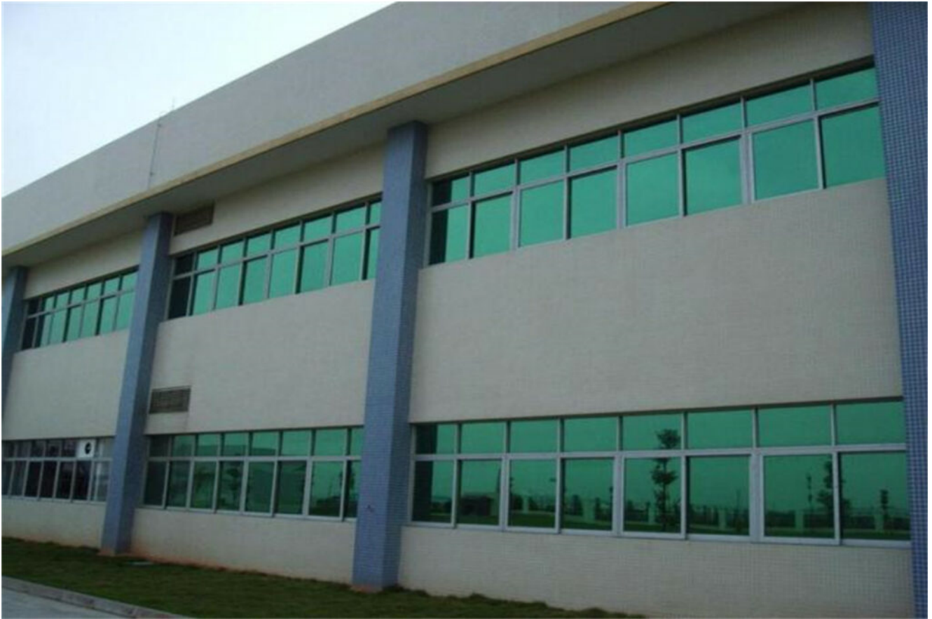
A warehouse windows use green solar reflective glass

C- Privacy: Depending on the level of reflectivity, green coated glass can provide some level of privacy during the day by making it difficult for outsiders to see into the building.