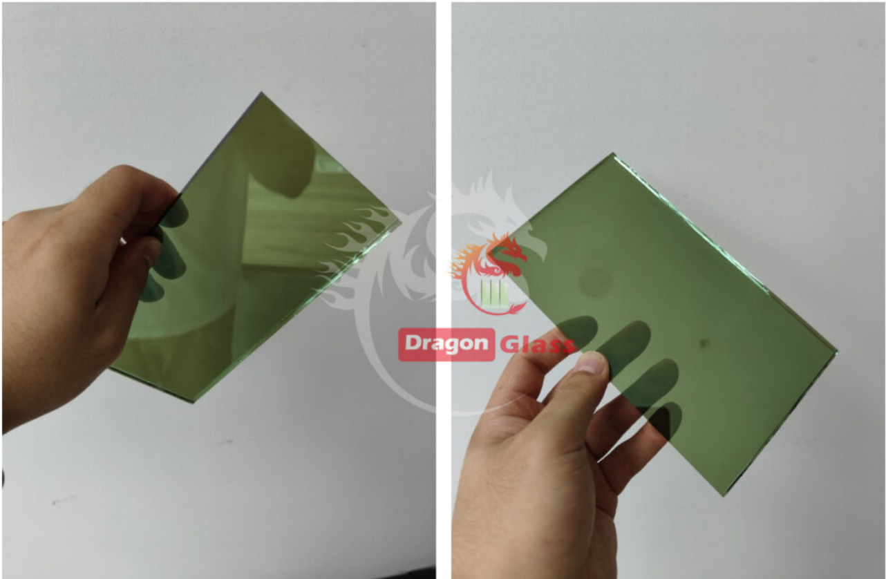
Green online coated glass samples showing