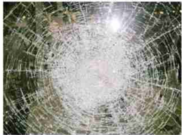
Tempered glass vs laminated glass breakage