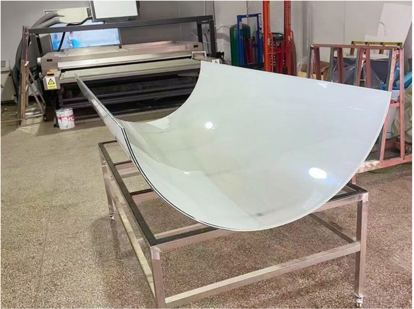
curved glass product