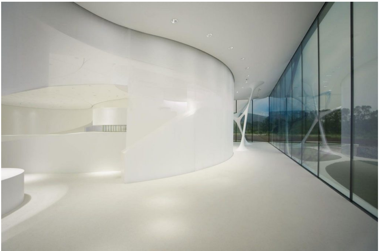
bent glass wall