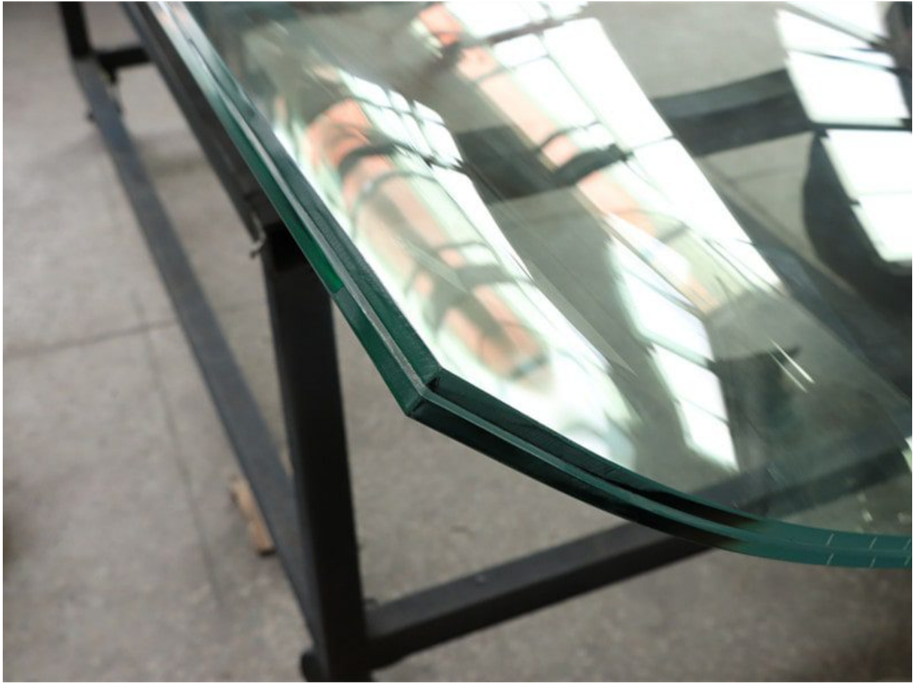
curved glass product