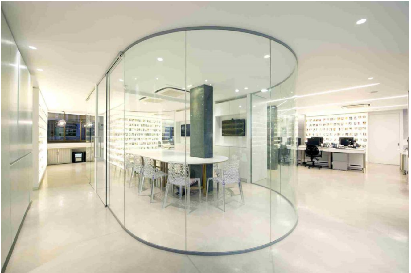
bent glass wall