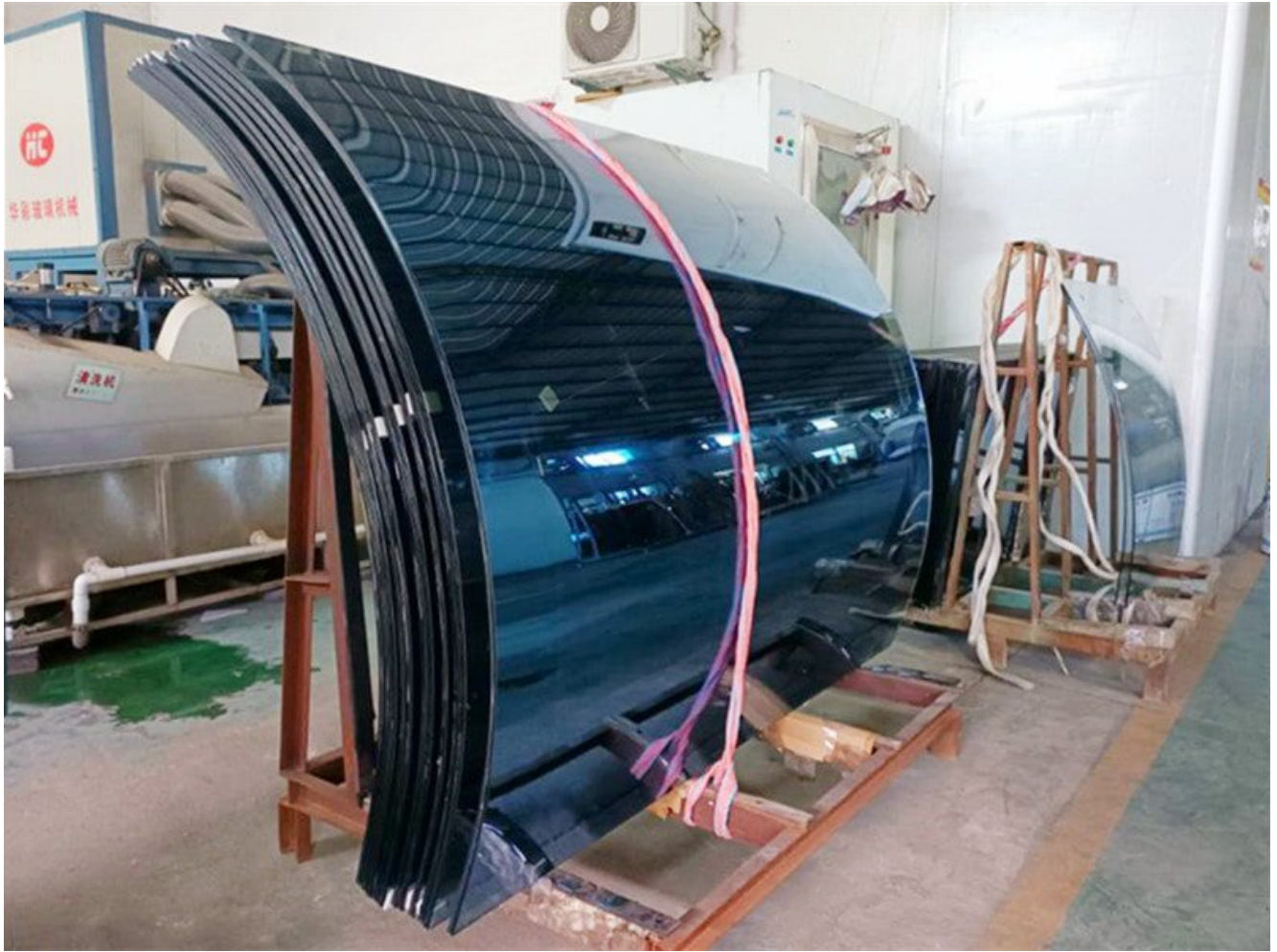
curved glass product