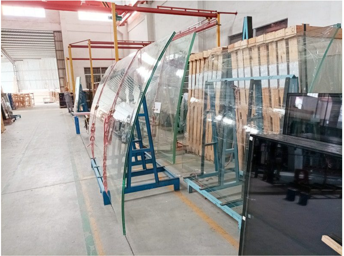
curved glass product