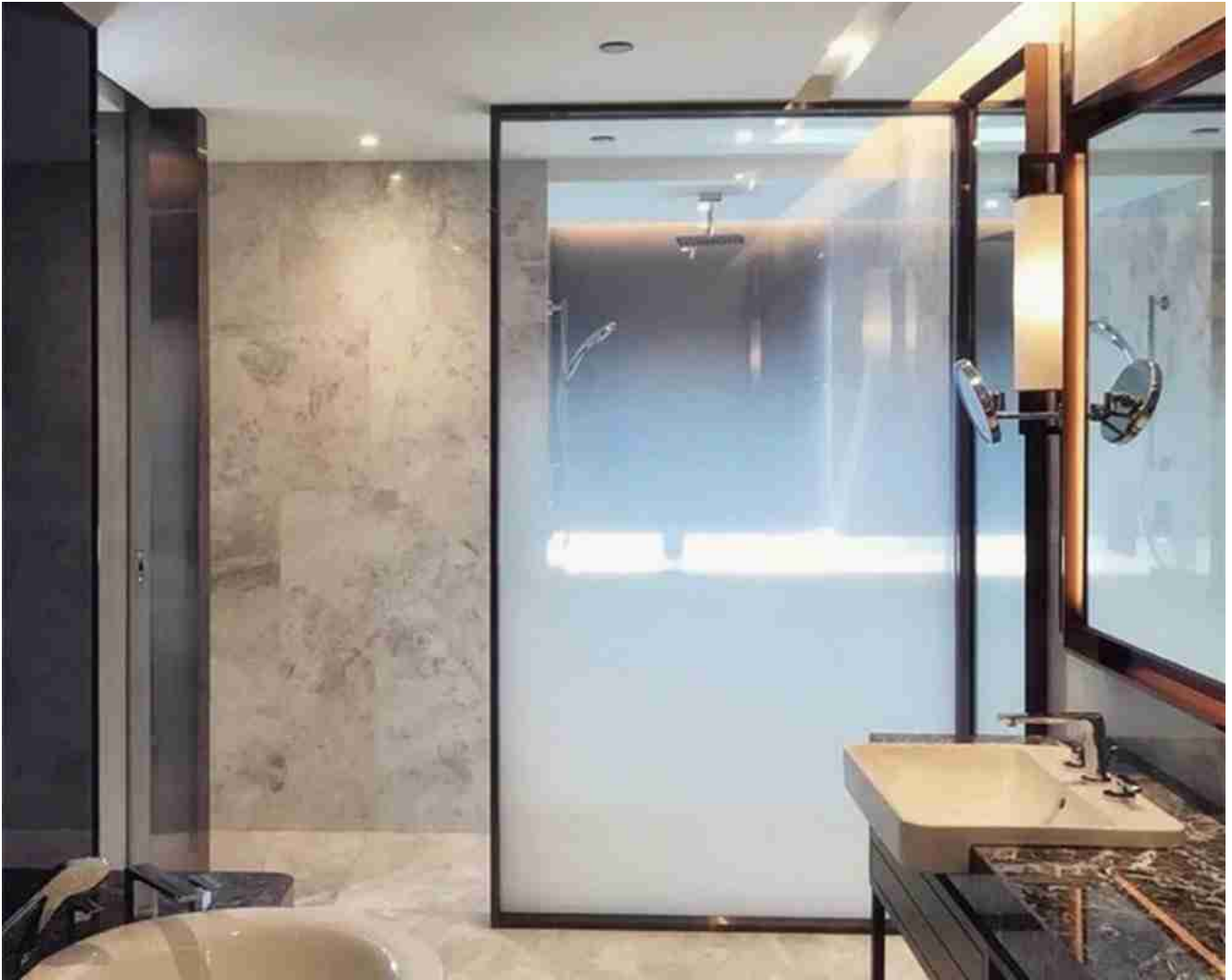
Gradient color shower doors tempered glass

If you have any interest in further discussion, welcome to contact us at any time.