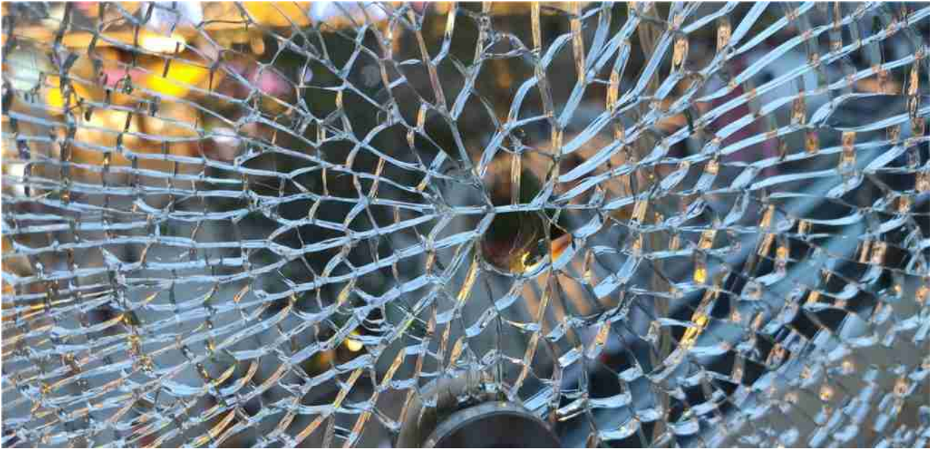
12mm toughened glass breakage

However toughened glass all has a potential risk of [REDACTED] , to reduce spontaneous breakage, heat soak test glass will be suggested.